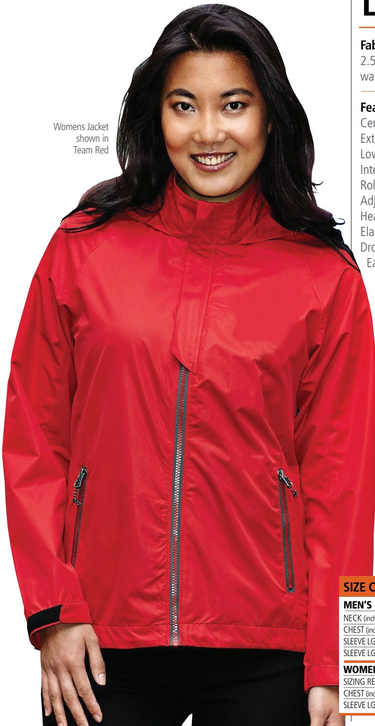
Womens Jacket shown in Team Red