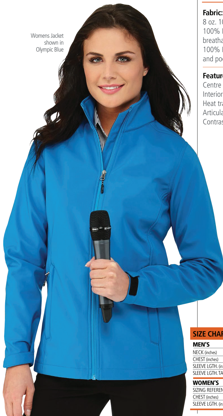
Womens Jacket shown in Olympic Blue