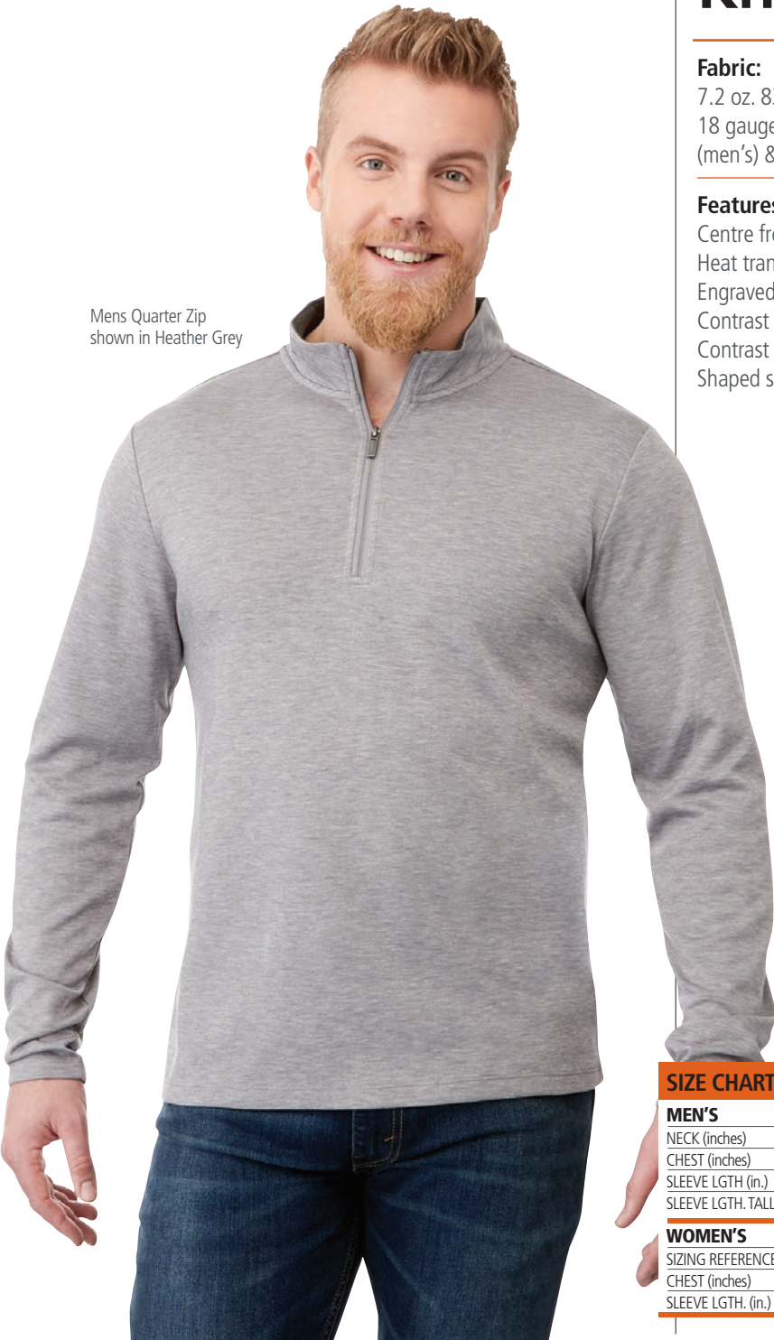
Mens Quarter Zip shown in Heather Grey