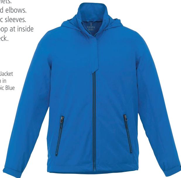
Mens Jacket shown in Olympic Blue