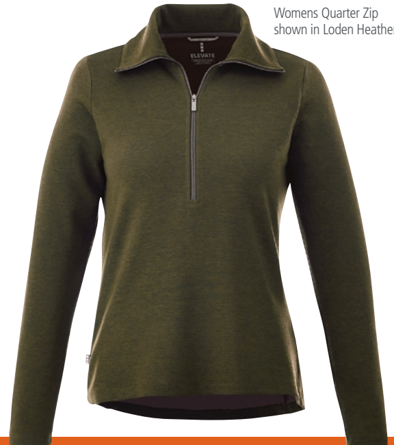
Womens Quarter Zip shown in Loden Heather

Centre front exposed coil zipper with contrast stitch. Heat transfer main label for tagless comfort. Engraved metal zipper pull. Contrast inner neck tape. Contrast hanger loop at inside back neck. Shaped seams and tapered waist for flattering fit (womens).