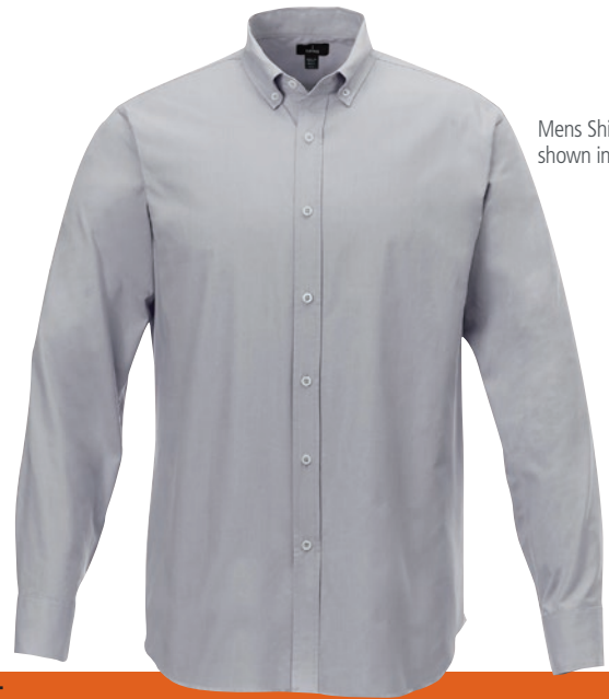
Mens Shirt shown in Silver

Centre front button placket. Self fabric collar with stand. Adjustable one button cuffs with single pleats. Shirttail hem. Contrast horn buttons. Flat-felled seams. Centre back box pleat (mens). Button-down shirt collar (mens). Hanger loop at exterior back yoke (mens). Back darts / bust darts (womens). Shaped seams and tapered waist for flattering fit (womens).