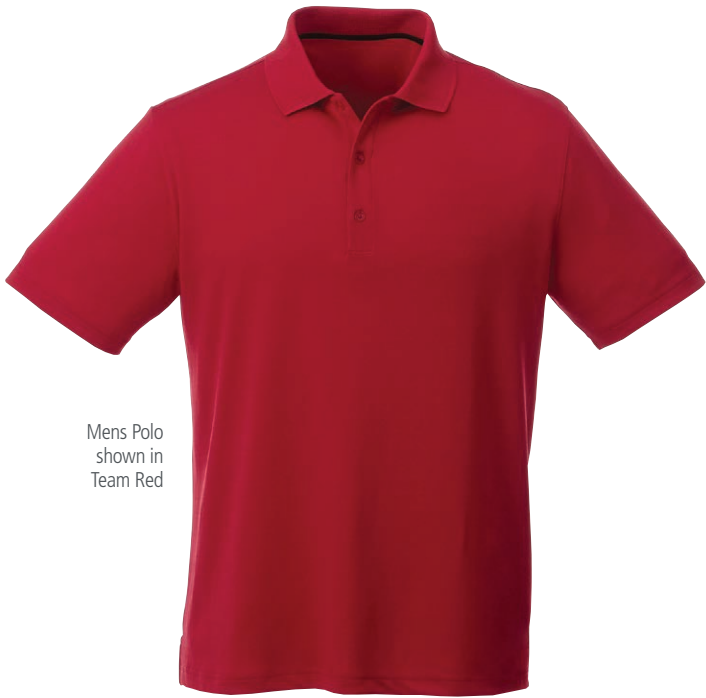
Mens Polo shown in Team Red