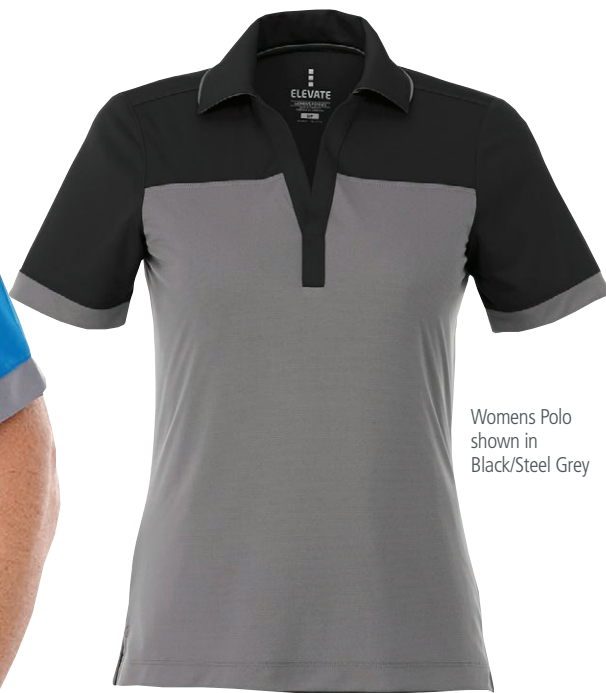
Womens Polo shown in Black/Steel Grey

Contrast inner neck tape and contrast inner v-notch side slits. Heat transfer main label for tagless comfort. Two piece self fabric collar. Contrast sleeve cuff detail. Diminishing contrast piping. Narrow coverstitch detail. Dyed-to-match buttons.