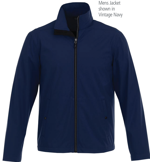
Mens Jacket shown in Vintage Navy

Centre front exposed reverse coil zipper, interior zipper flap. Lower welt pockets with snap closure. Easy grip zipper pulls. Articulated elbows, ergonomic sleeves. Contrast hanger loop at inside back neck. Interior back yoke for custom branding.