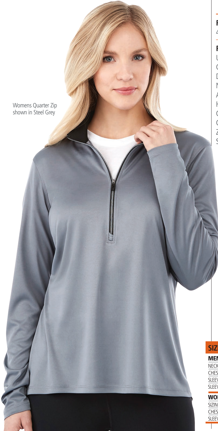
Womens Quarter Zip shown in Steel Grey