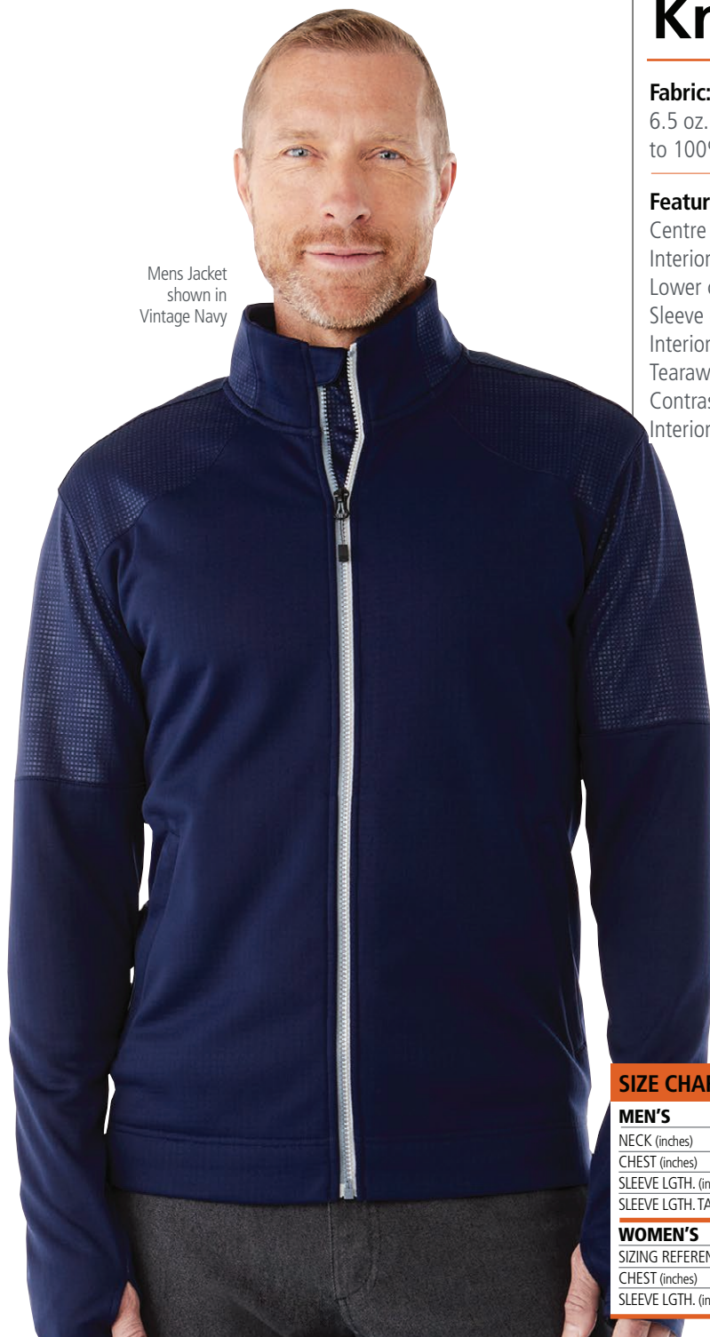
Mens Jacket shown in Vintage Navy