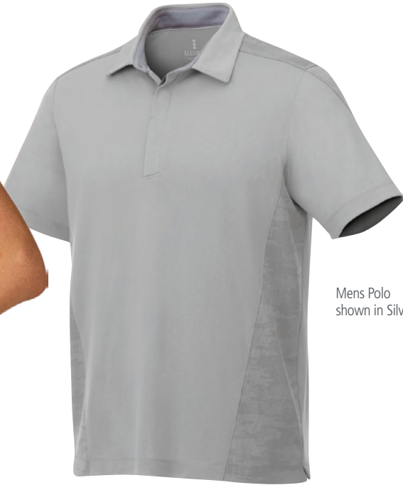
Mens Polo shown in Silver