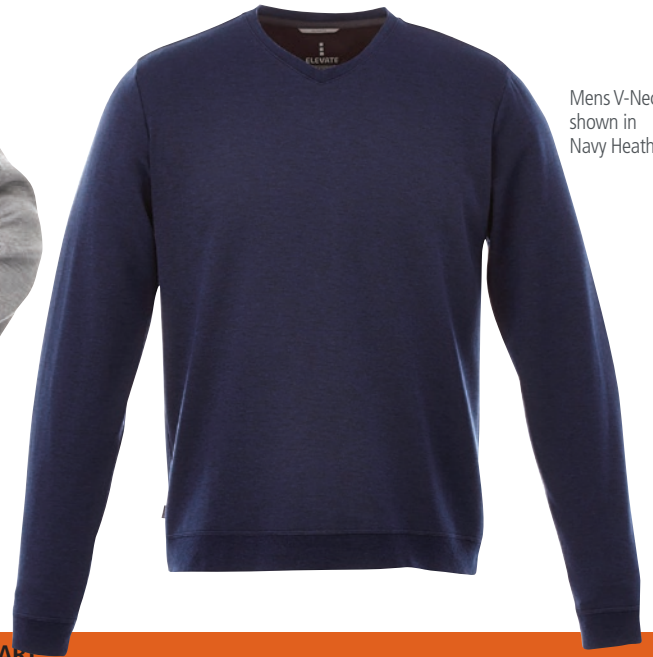
Mens V-Neck shown in Navy Heather

Shaped seams and tapered waist for flattering fit (womens).