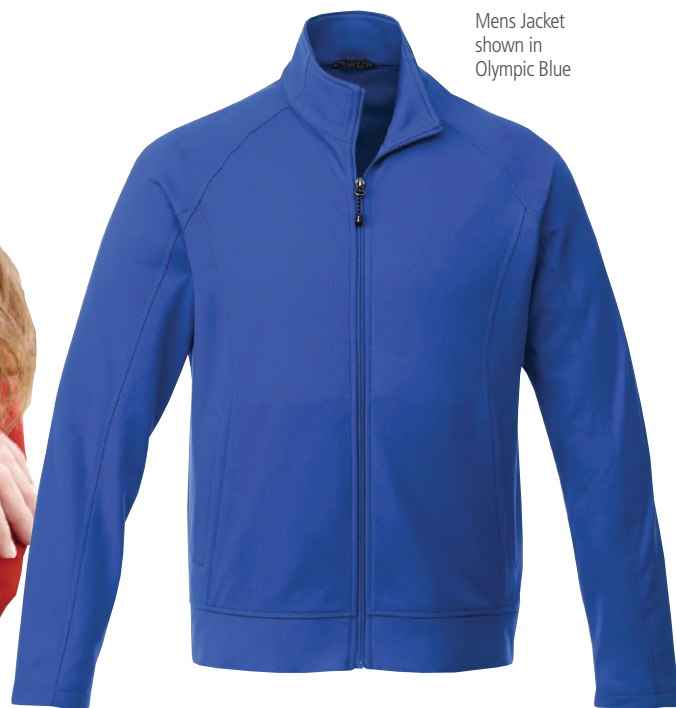
Mens Jacket shown in Olympic Blue