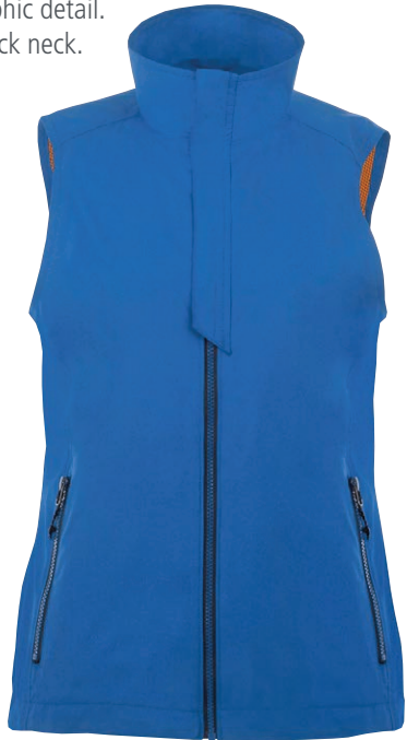
Womens Vest shown in Olympic Blue/ Saffron