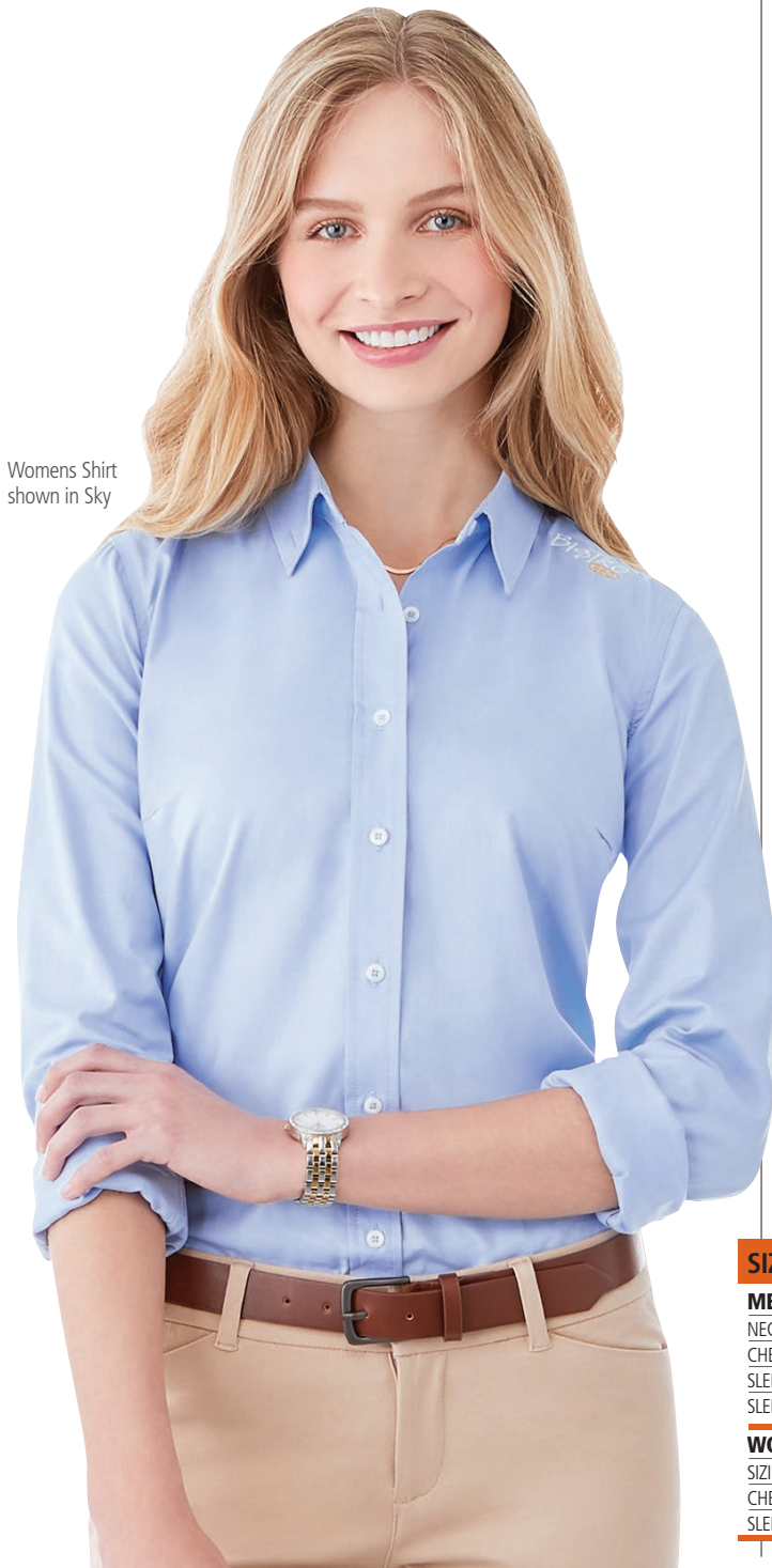
Womens Shirt shown in Sky