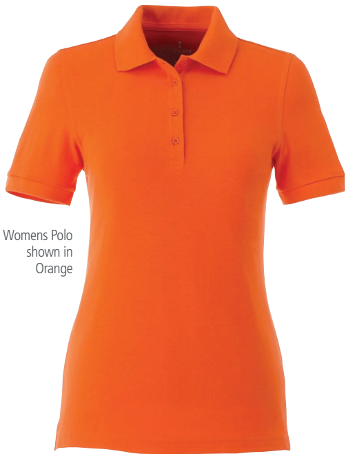
Womens Polo shown in Orange

Centre front three button placket. Flat knit collar, flat knit cuffs, v-notch side slits. Twin needle topstitching, dyed-to-match buttons. Heat transfer main label for tagless comfort. Hanger loop at inside back neck.