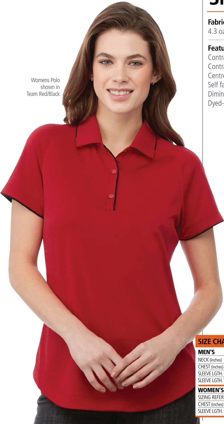
Womens Polo shown in Team Red/Black