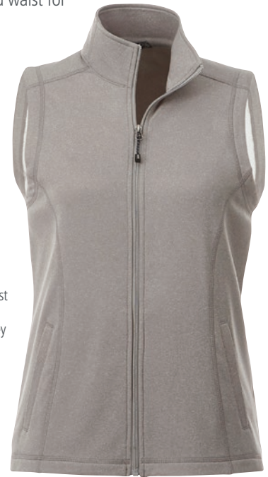
Womens Vest shown in Heather Grey

Centre front exposed coil zipper. Lower welt pockets. Interior media pocket. Flatlocking detail. Easy grip zipper pulls. Interior media exit port. Tearaway-cutaway main label for tagless comfort. Contrast hanger loop at inside back neck. Shaped seams and tapered waist for flattering fit (womens).