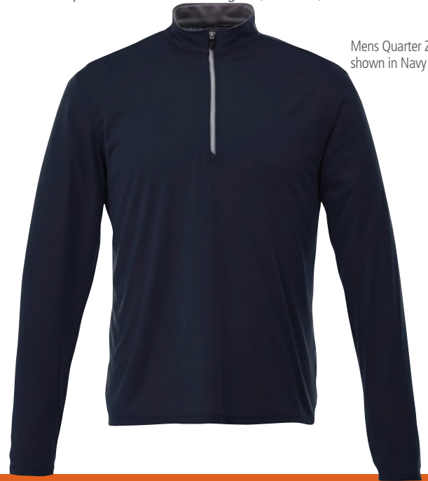
Mens Quarter Zip shown in Navy

Shaped seams and tapered waist for flattering fit (womens).