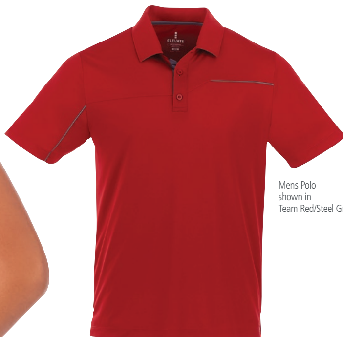
Mens Polo shown in Team Red/Steel Grey