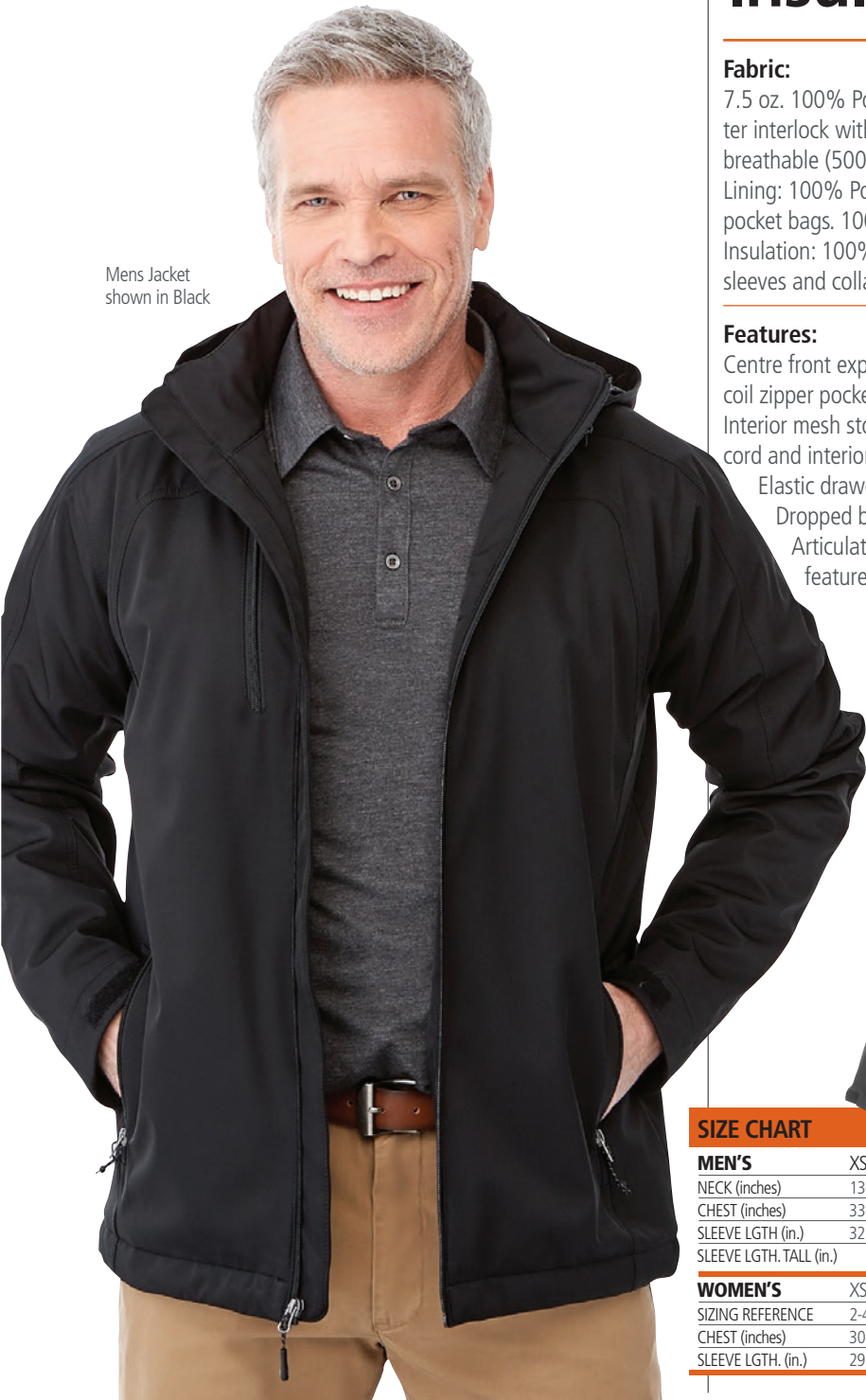
Mens Jacket shown in Black