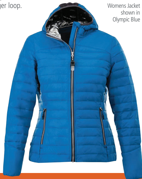
Womens Jacket shown in Olympic Blue