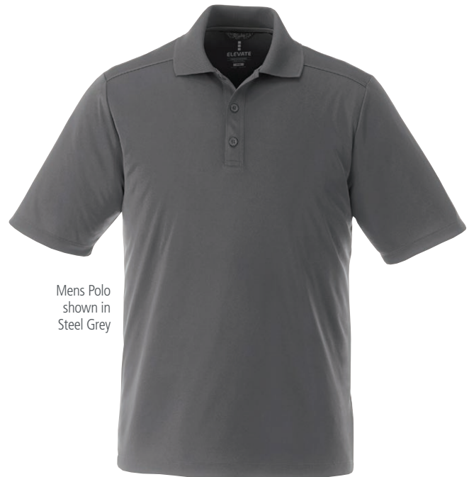
Mens Polo shown in Steel Grey

Centre front three button placket. Flat knit collar, narrow twin needle topstitch detail. Dyed-to-match buttons. Heat transfer main label for tagless comfort. Contrast interior stitching detail, contrast inner neck tape. Hanger loop at inside back neck.