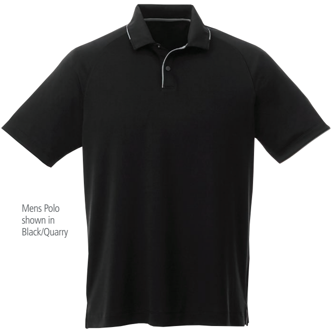
Mens Polo shown in Black/Quarry