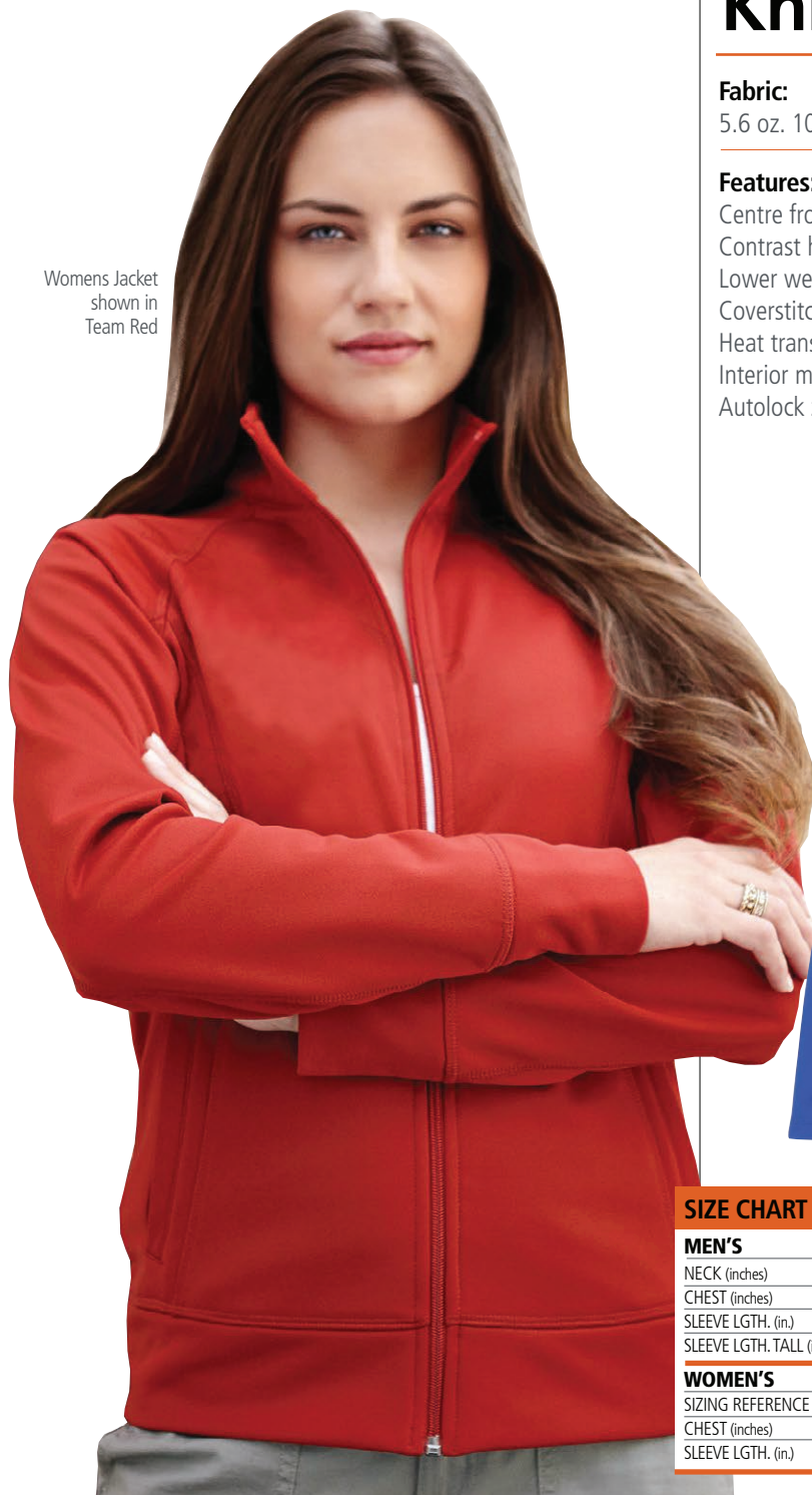
Womens Jacket shown in Team Red