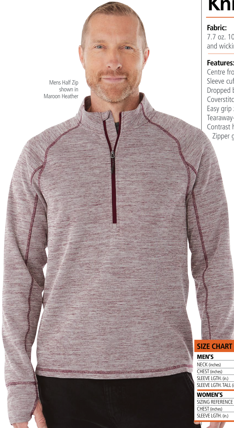
Mens Half Zip shown in Maroon Heather