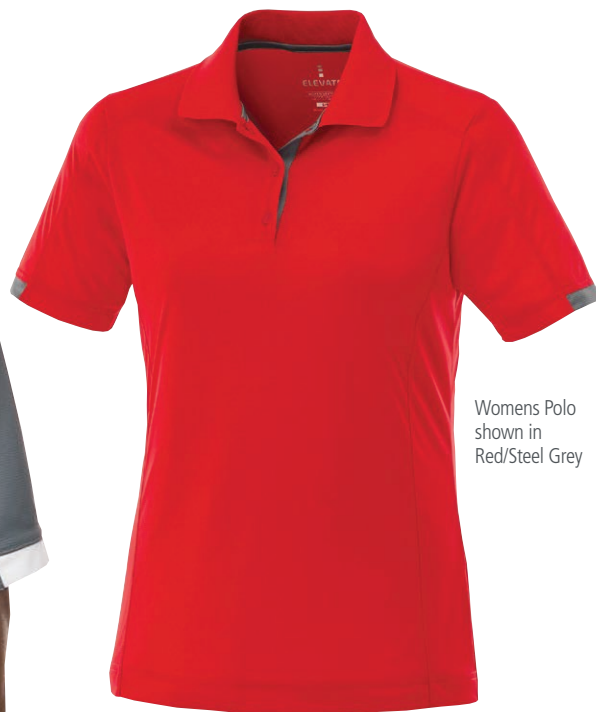
Womens Polo shown in Red/Steel Grey

Contrast interior stitching detail, contrast inner neck tape and contrast inner placket.