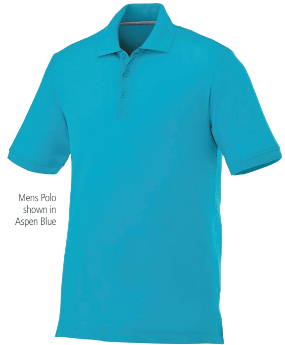
Mens Polo shown in Aspen Blue

Centre front three button placket. Flat knit collar, flat knit cuffs. V-notch side slits. Dyed-to-match buttons. Contrast inner neck tape.