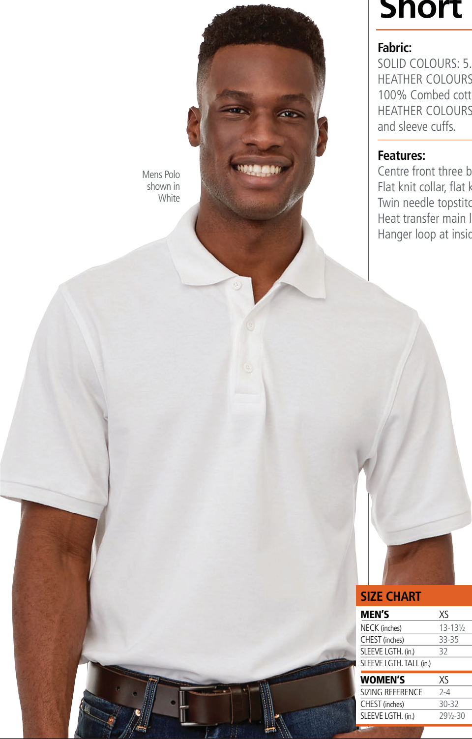
Mens Polo shown in White