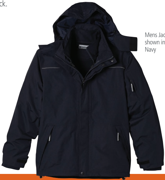
Mens Jacket shown in Navy

Centre front placket with snap closures over two-way heavy-duty plastic zipper. Lower cargo pockets with coil zipper. Upper sleeve welded coil zipper pocket. Interior pockets with hook and loop closure. Detachable snap off hood with drawcord and interior cordlocks. Adjustable cuff tabs with hook and loop closure. Elastic drawcord at hem with interior cordlocks. Dropped back hem. Diminishing reflective piping. Triple needle topstitching. Critical seam sealed. Articulated elbows. Interior system snap tabs for liner add in. Hanger loop at inside back neck.