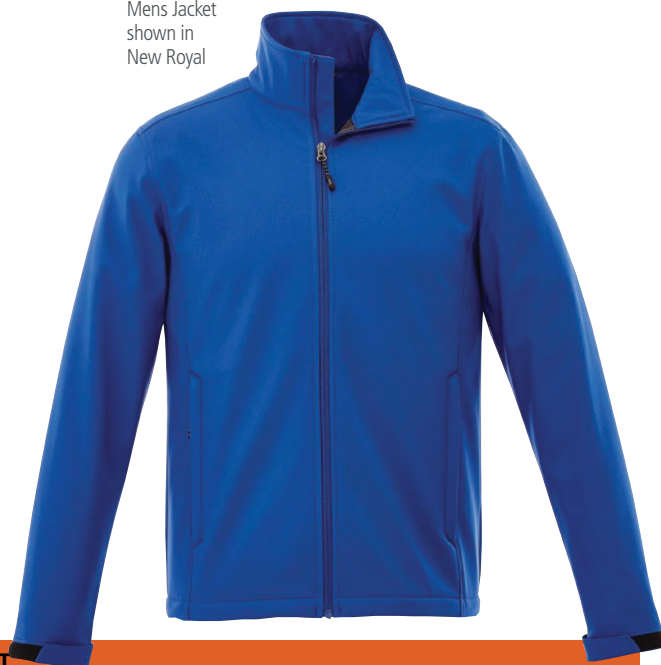
Mens Jacket shown in New Royal

Centre front exposed contrast reverse coil zipper. Interior zipper flap, lower welt pockets with coil zipper. Heat transfer main label for tagless comfort. Articulated elbows, ergonomic sleeves. Contrast hanger loop at inside back neck.