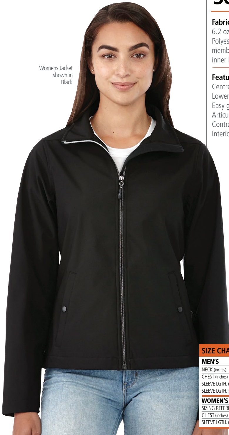
Womens Jacket shown in Black