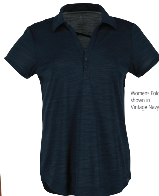
Womens Polo shown in Vintage Navy

Shaped seams and tapered waist for flattering fit (womens).