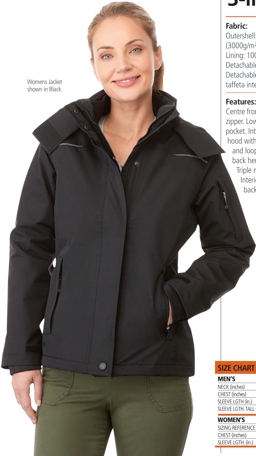
Womens Jacket shown in Black