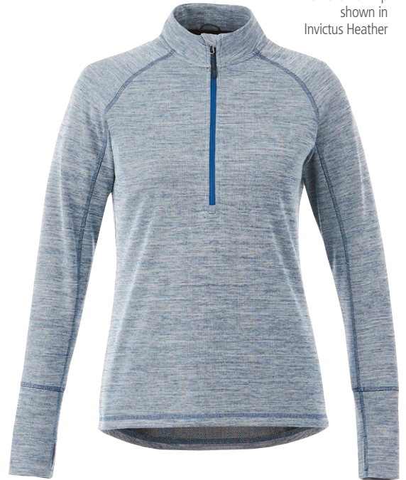
Womens Half Zip shown in Invictus Heather