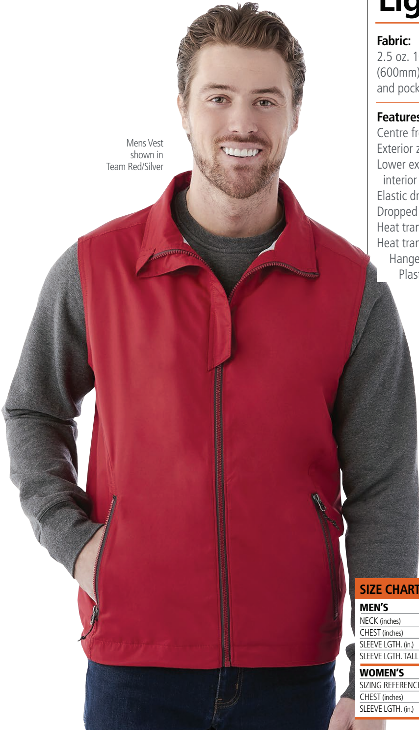
Mens Vest shown in Team Red/Silver