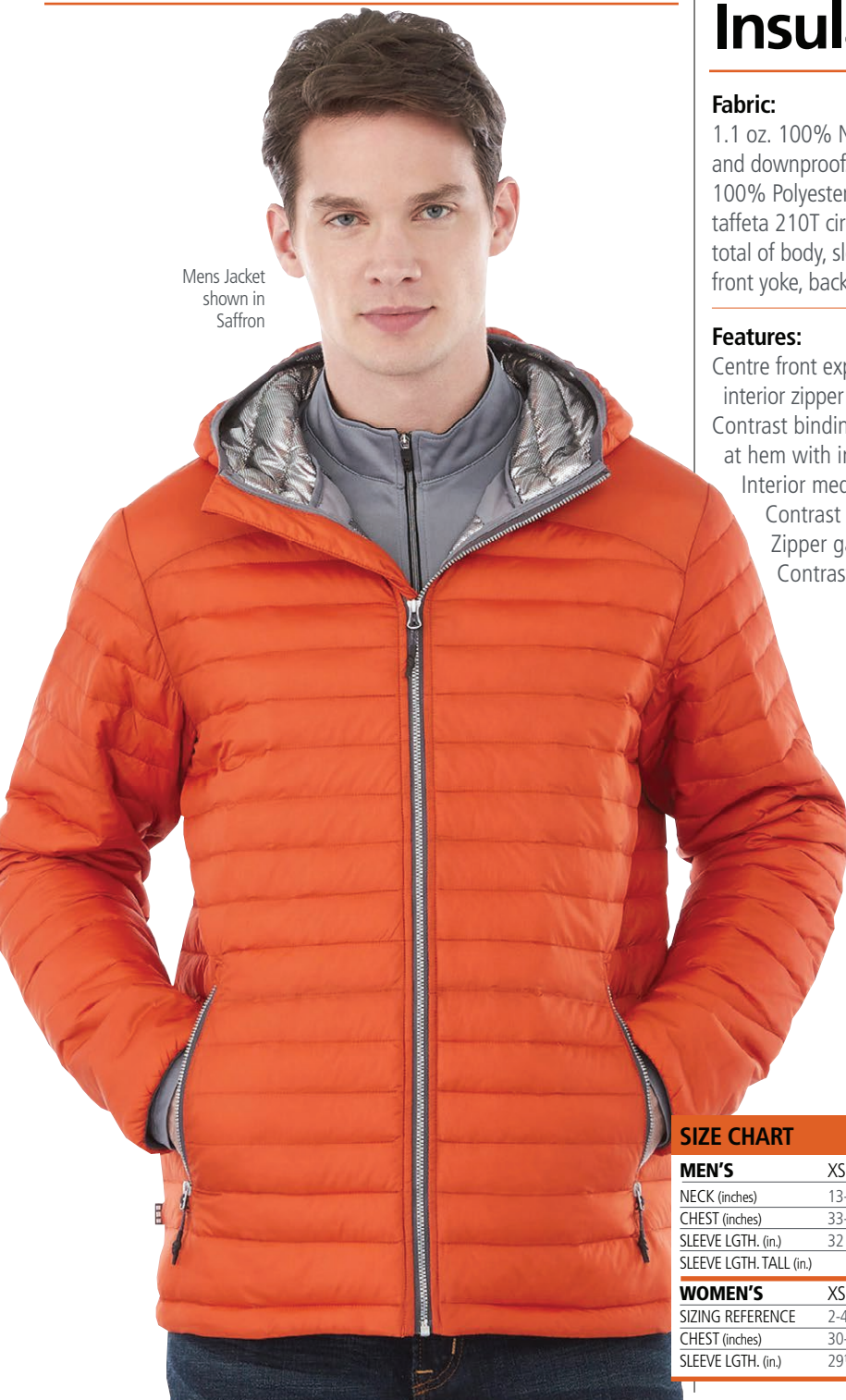
Mens Jacket shown in Saffron