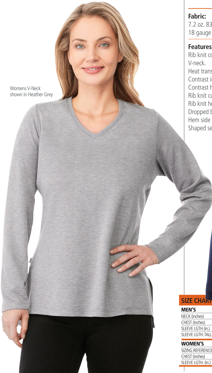
Womens V-Neck shown in Heather Grey