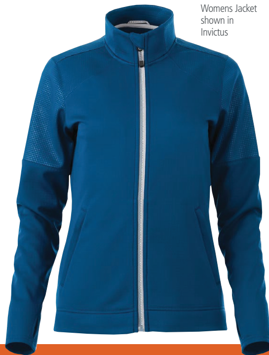
Womens Jacket shown in Invictus