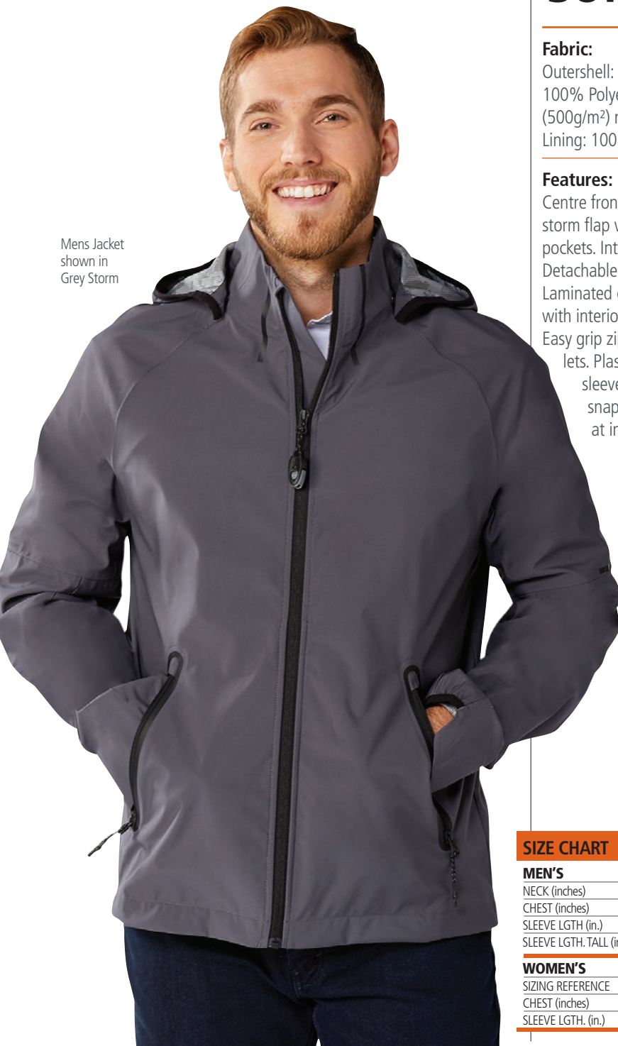
Mens Jacket shown in Grey Storm