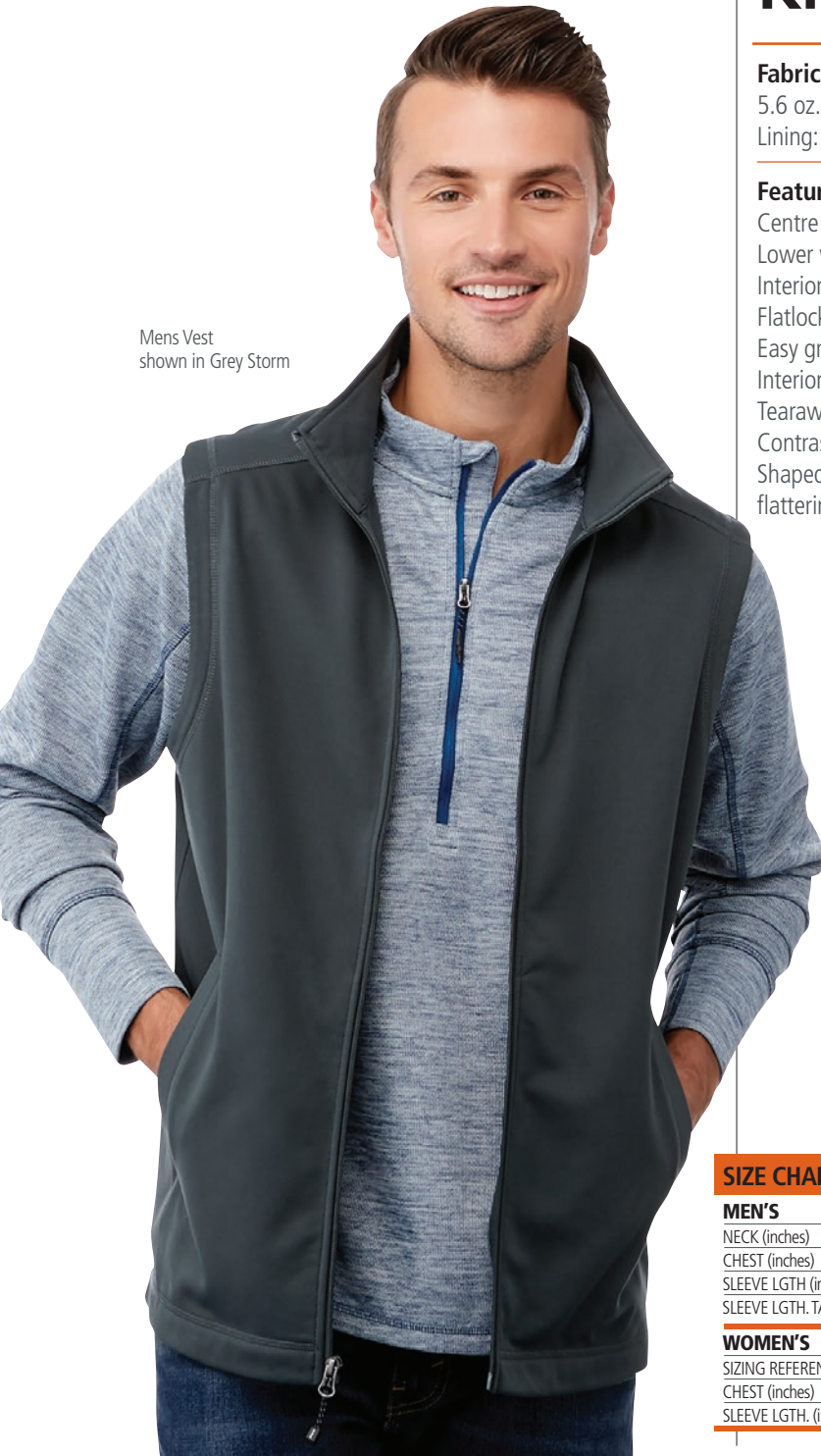
Mens Vest shown in Grey Storm