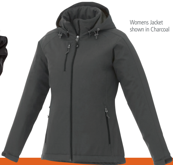
Womens Jacket shown in Charcoal

Centre front exposed coil zipper. Interior storm flap. Lower/upper exposed coil zipper pocket(s). Interior pocket with hook and loop closure. Interior mesh stowable pocket. Detachable zip off contour hood with drawcord and interior cordlocks. Adjustable cuff tabs with hook and loop closure. Elastic drawcord at hem with interior cordlocks. Dropped back hem. Narrow twin needle topstitch detail. Metal eyelets. Articulated elbows. Contrast inner hood. Zipper garage pocket feature. Contrast hanger loop at inside back neck.