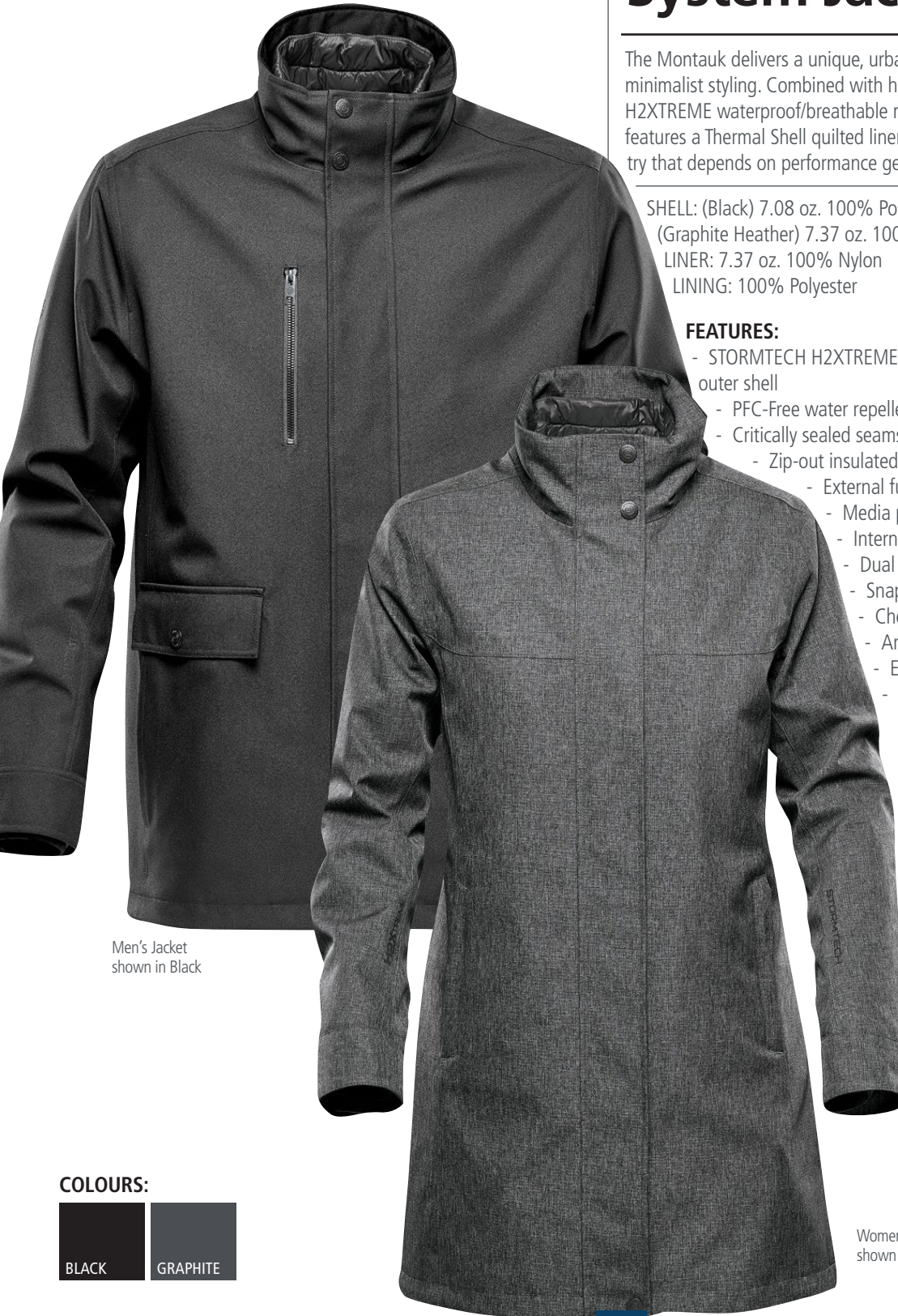
Men's Jacket shown in Black