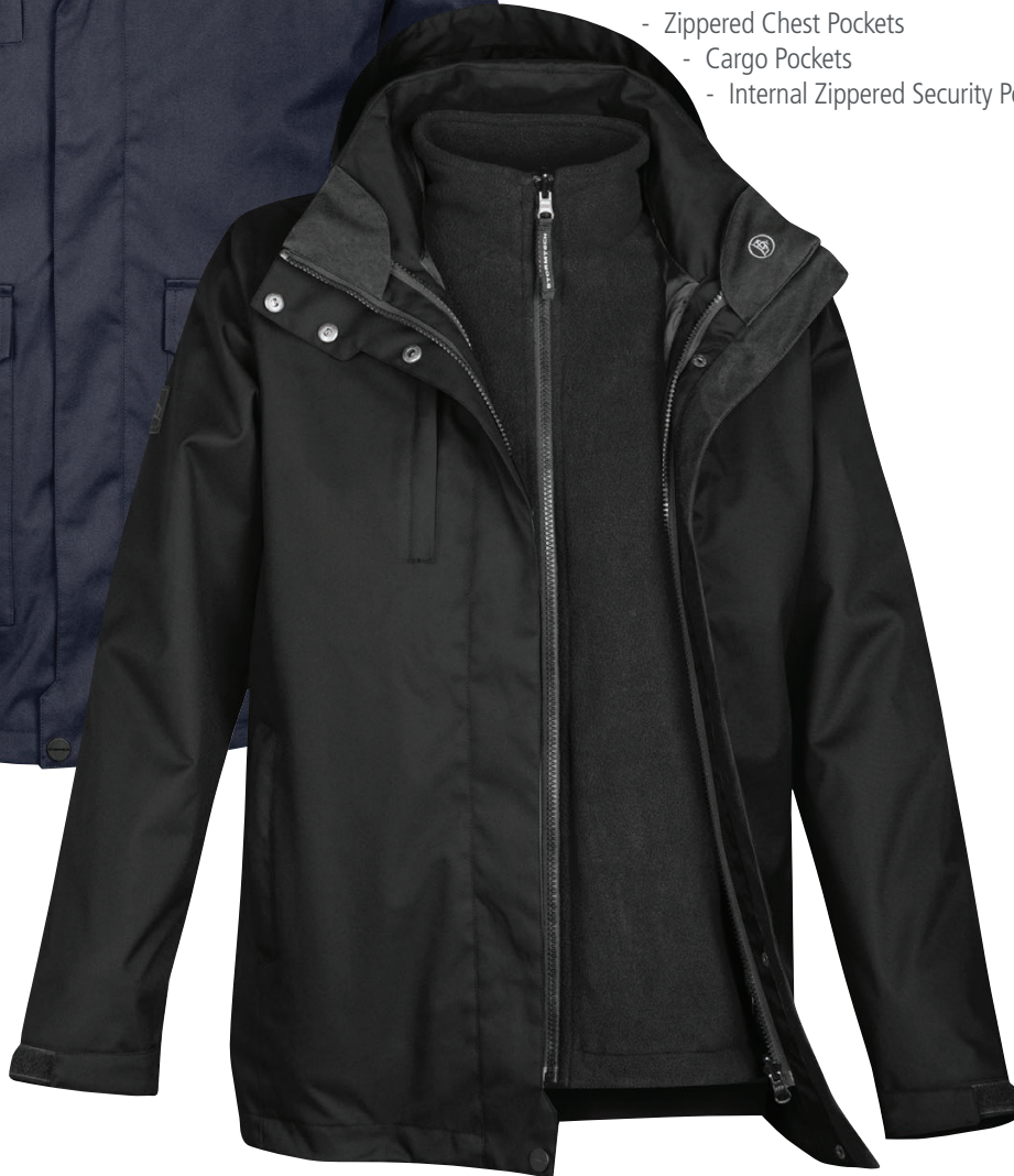
Women's Jacket shown in Black