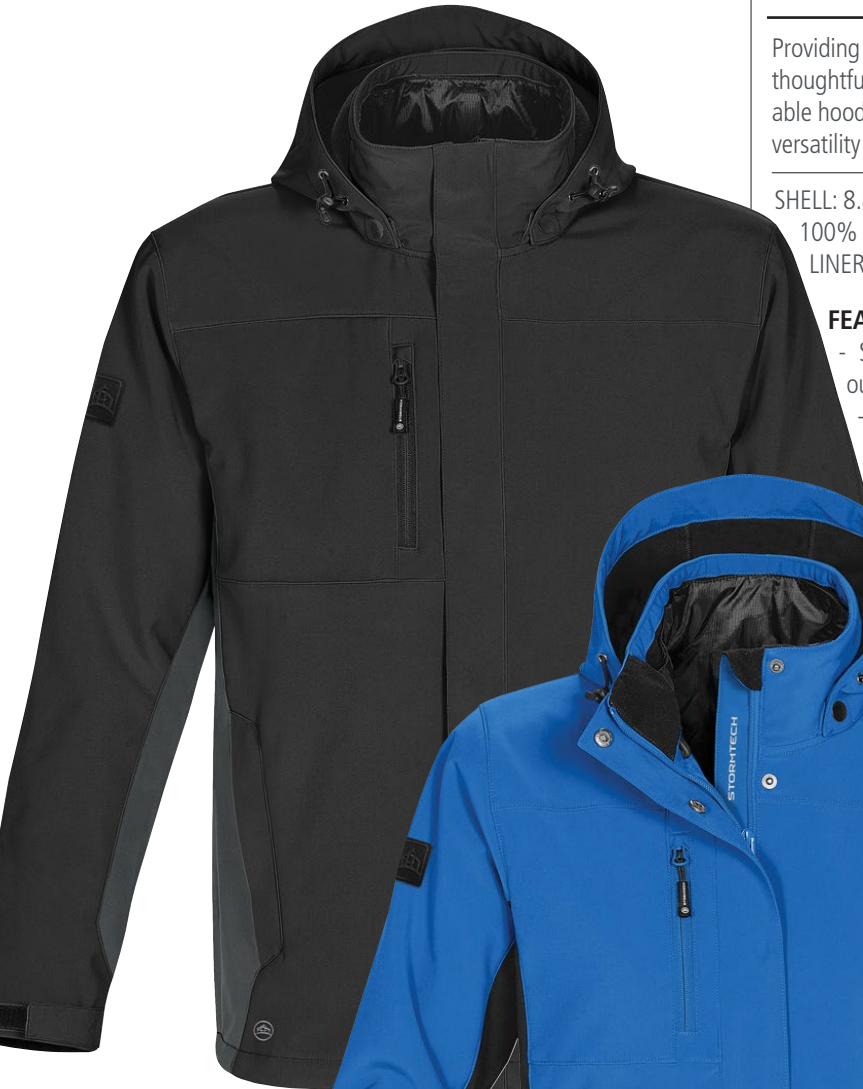
Men's Jacket shown in Black/Granite