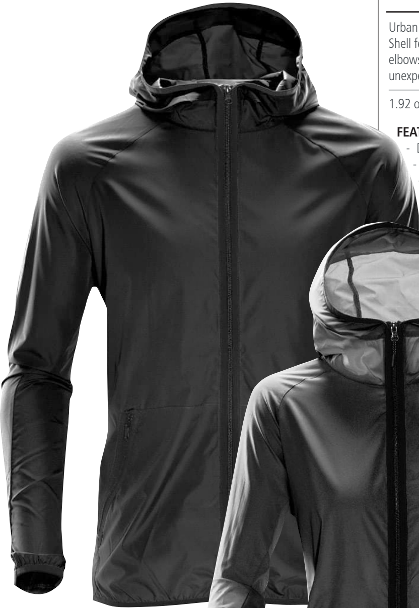
Men's Jacket shown in Black