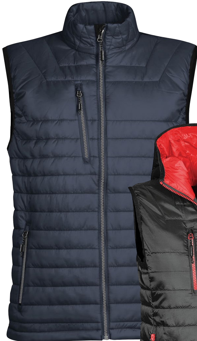
Men's Vest shown in Navy/Charcoal

(S-5XL in Men's Black, XS-3XL in Women's Black)