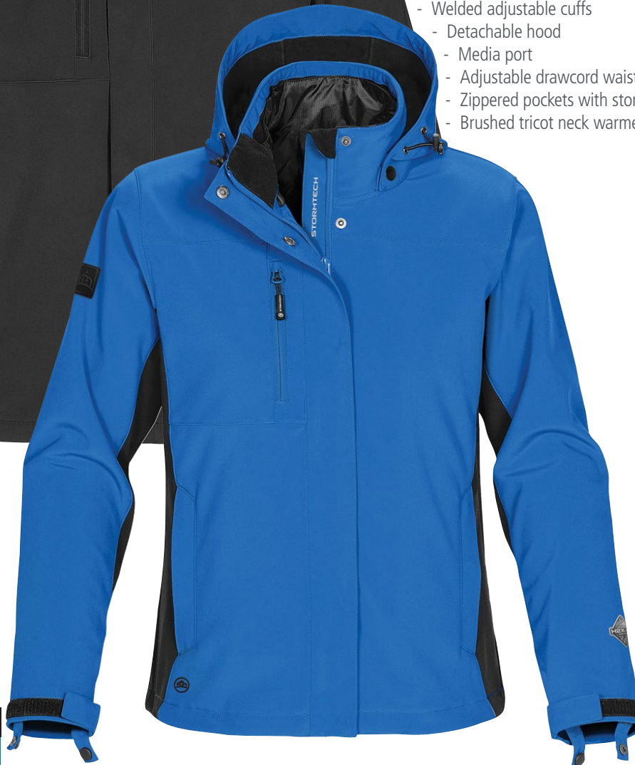
Women's Jacket shown in Marine Blue/Black