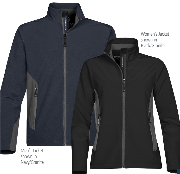
Women's Jacket shown in Black/Granite

(S-5XL in Men's Black/Granite, XS-3XL in Women's Black/Granite)