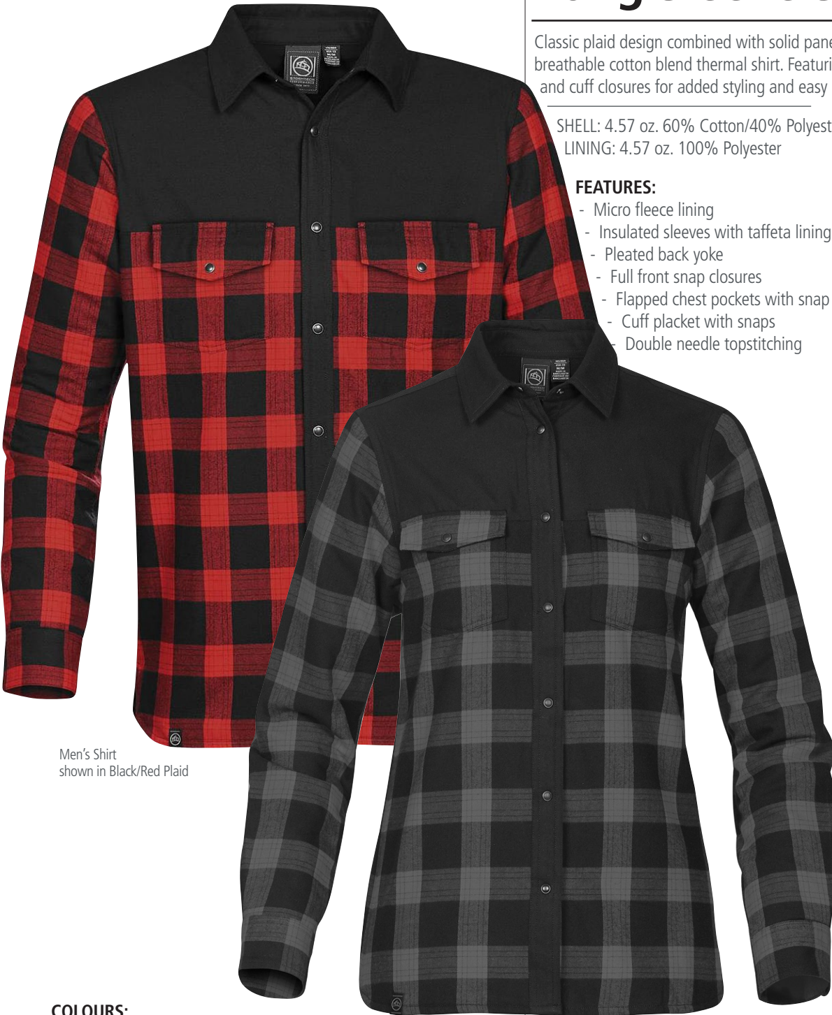
Men's Shirt shown in Black/Red Plaid