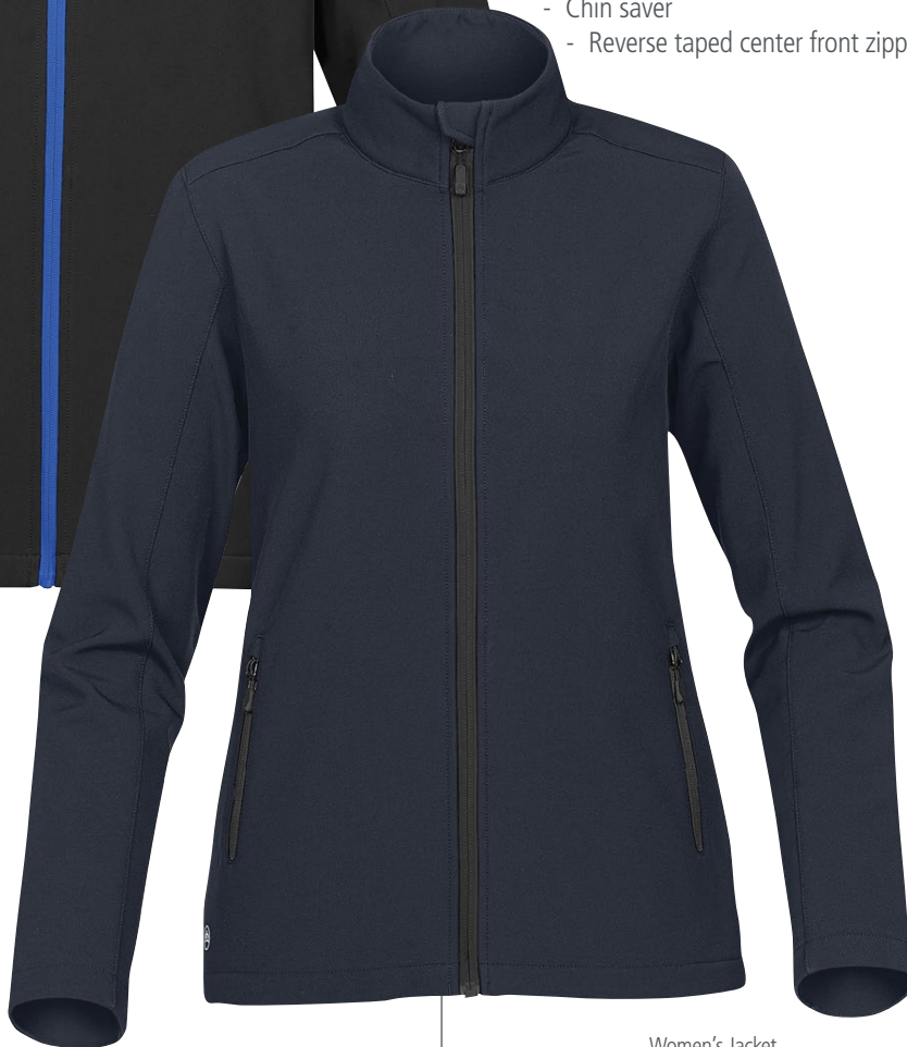
Women's Jacket shown in Navy/Carbon