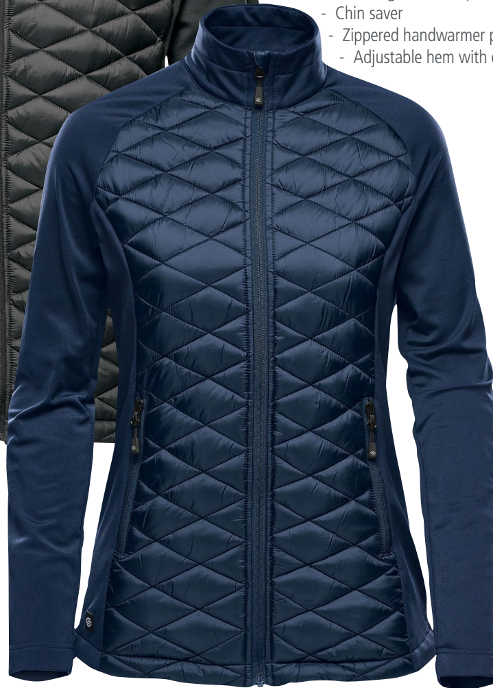
Women's Jacket shown in Indigo