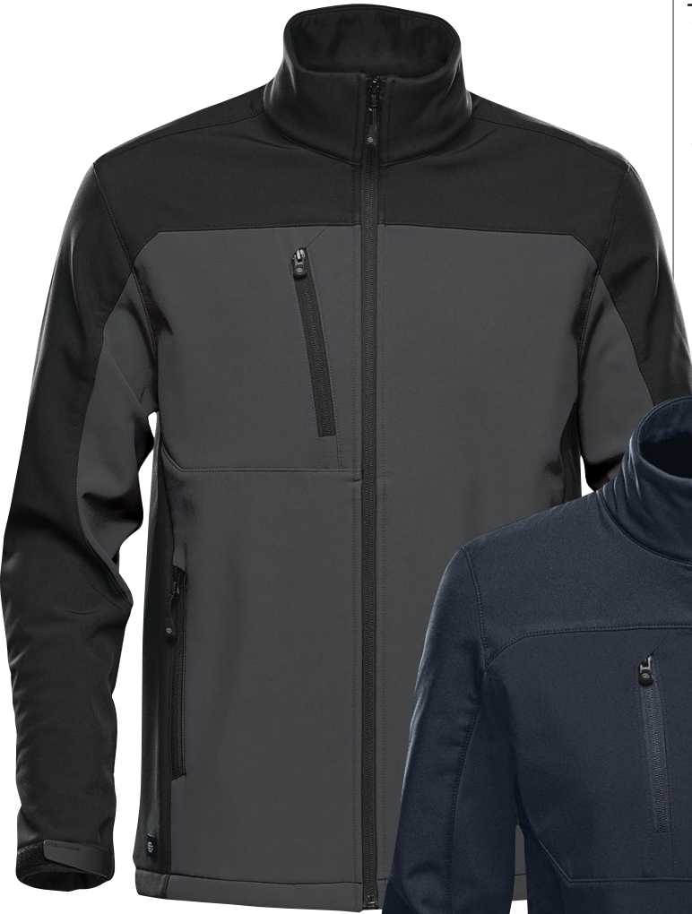
Men's Jacket shown in Dolphin/Black