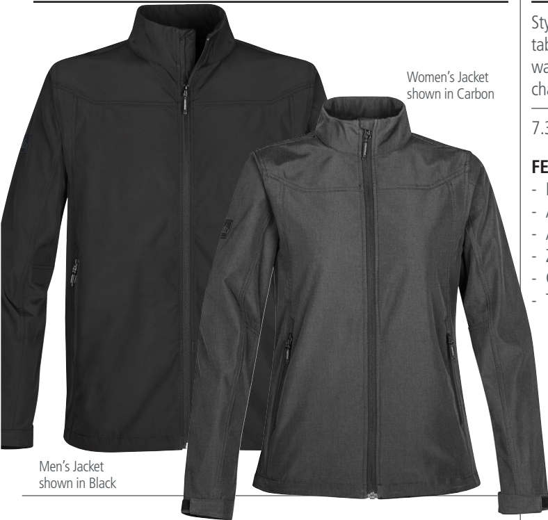
Women's Jacket shown in Carbon