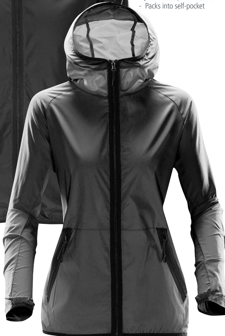
Women's Jacket shown in Dolphin