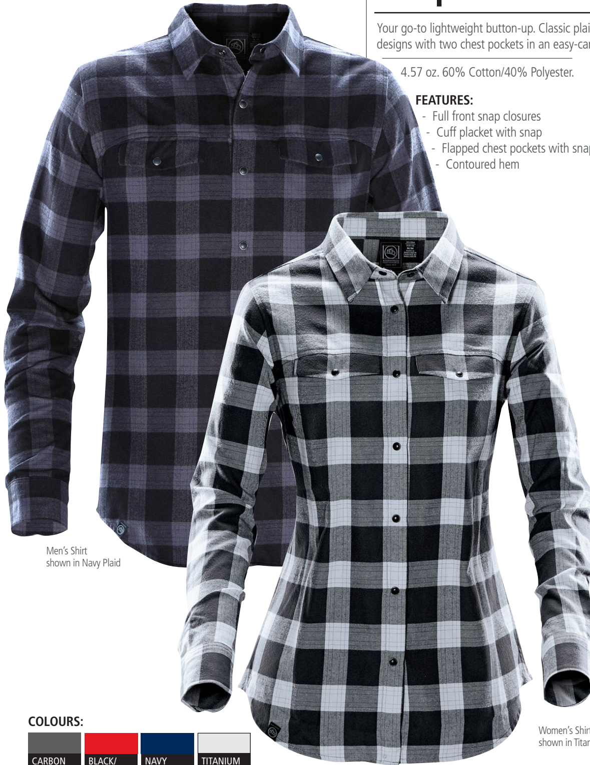
Men's Shirt shown in Navy Plaid