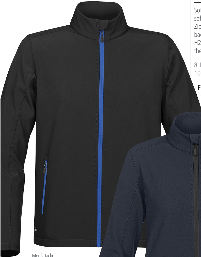
Men's Jacket shown in Black/Azure Blue

(S-5XL in Men's Black/Carbon, XS-3XL in Women's Black/Carbon)