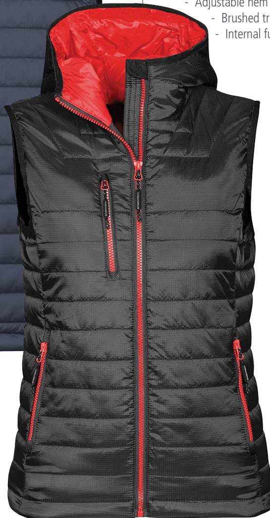
Women's Vest shown in Black/True Red