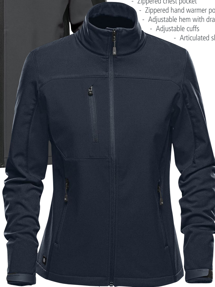
Women's Jacket shown in Navy/Navy