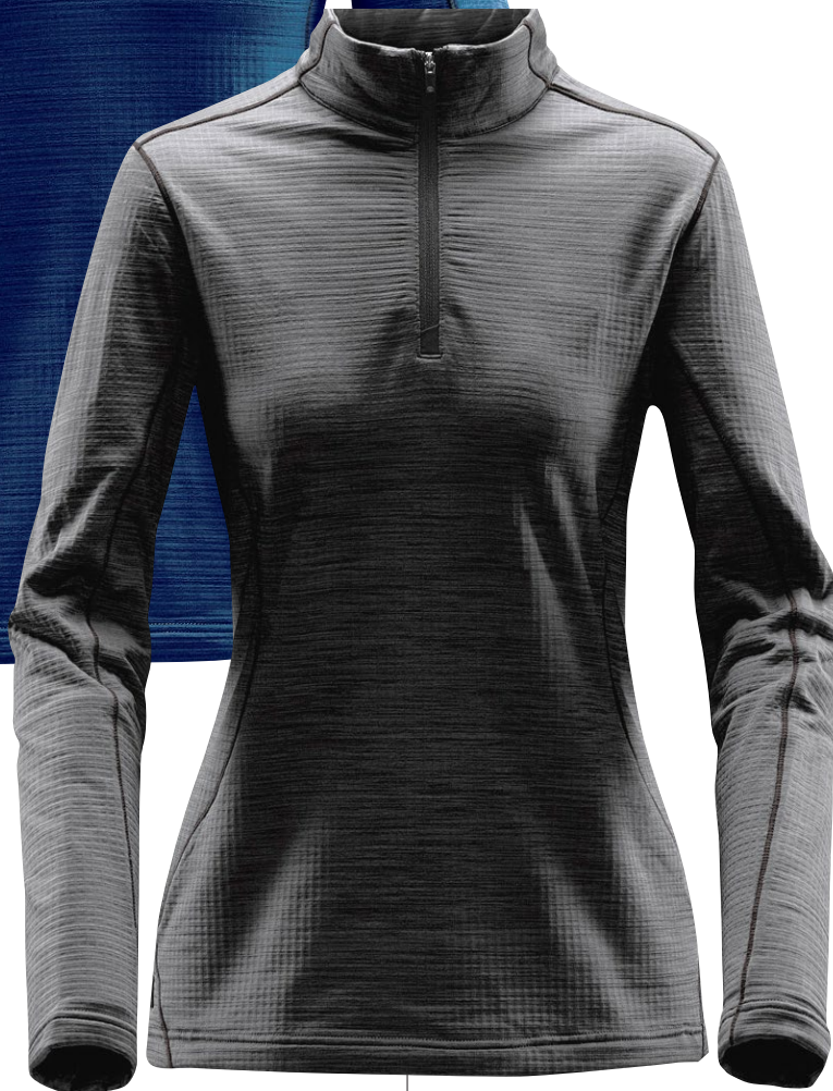
Women's Quarter Zip shown in Dolphin