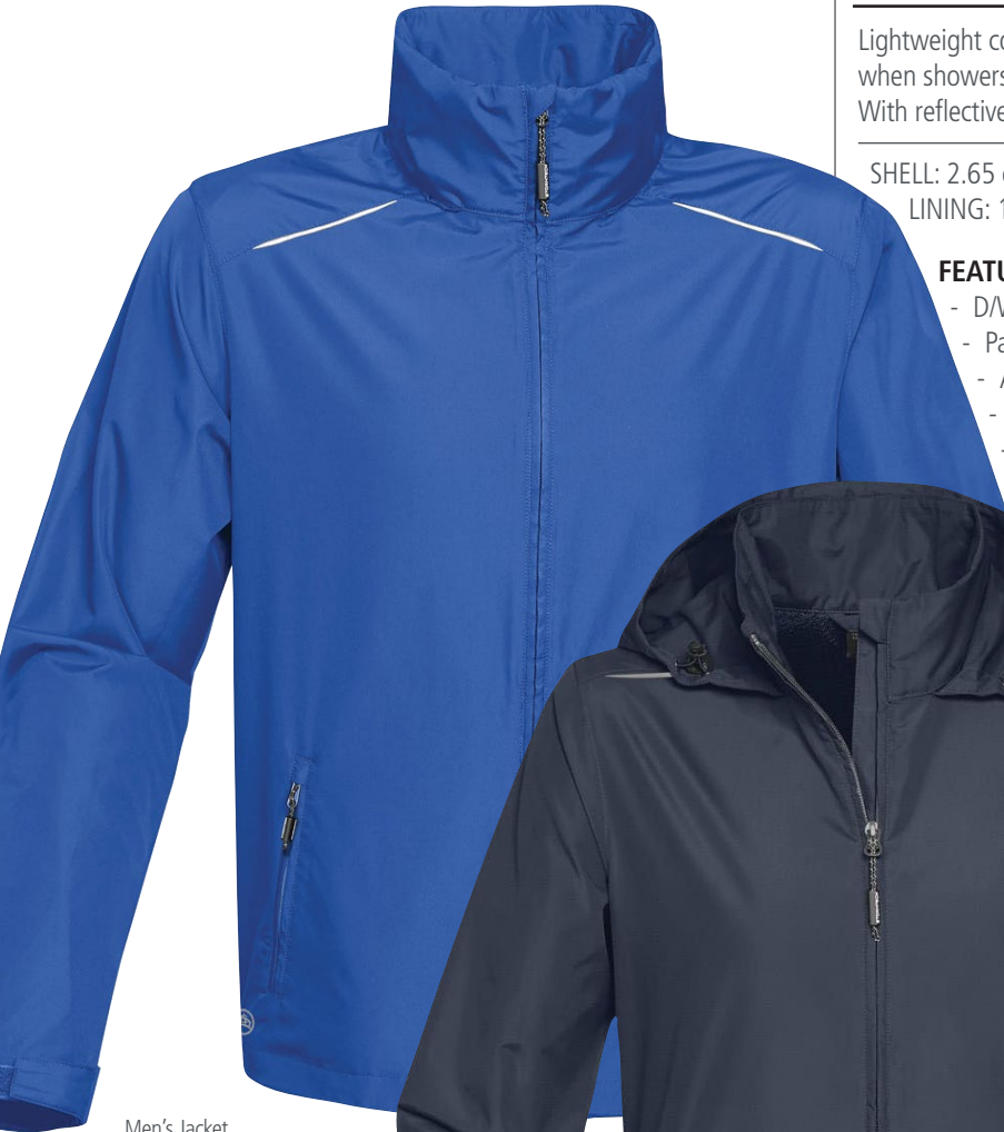
Men's Jacket shown in Azure Blue