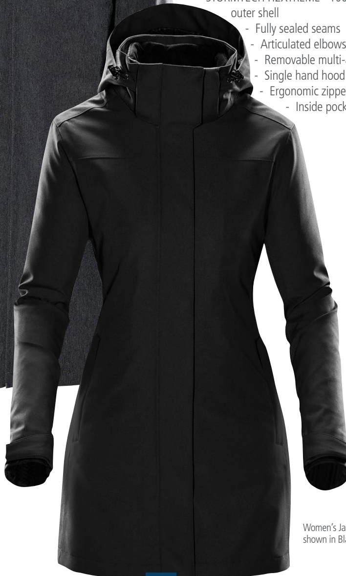
Women's Jacket shown in Black