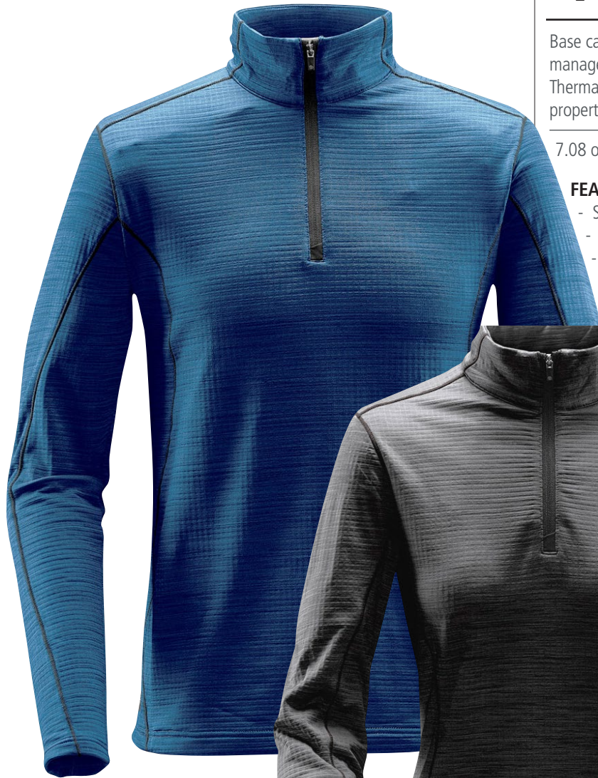
Men's Quarter Zip shown in Ocean