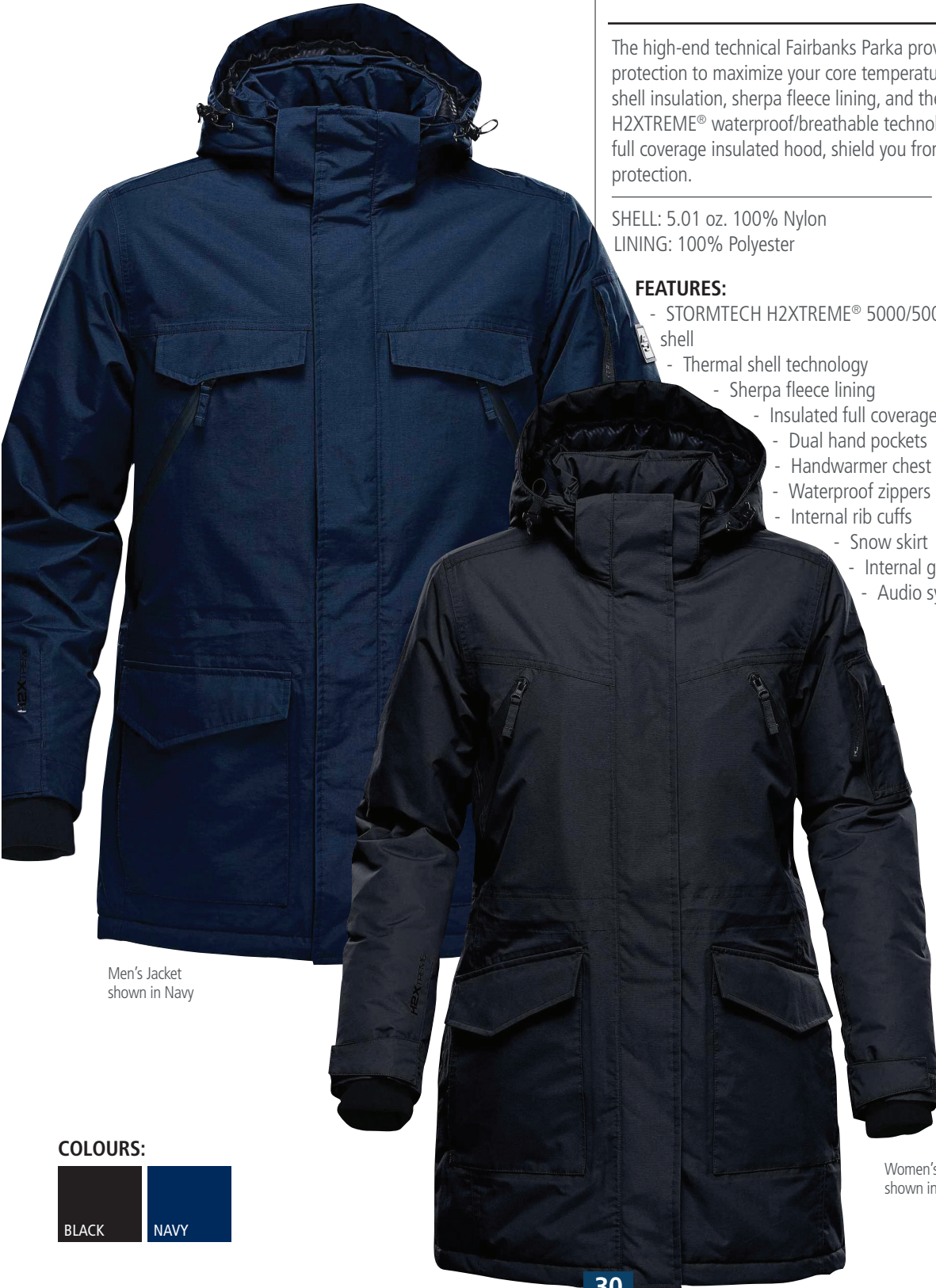
Men's Jacket shown in Navy