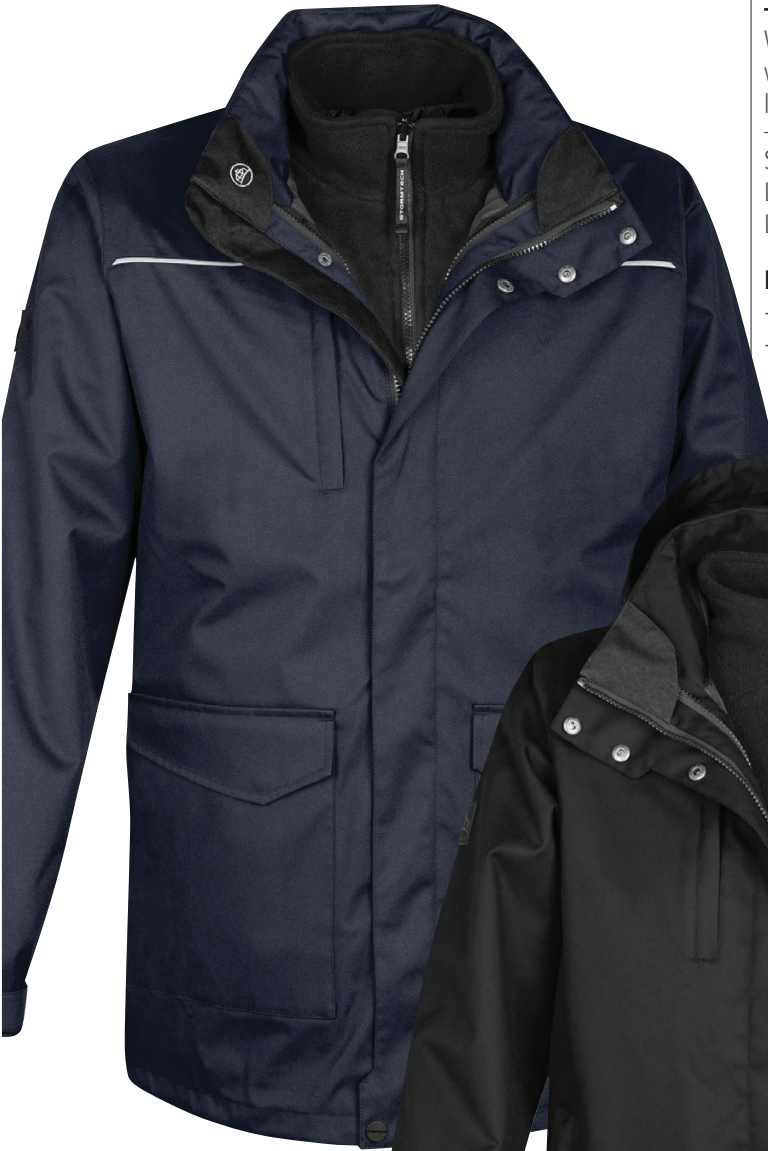
Men's Jacket shown in Navy