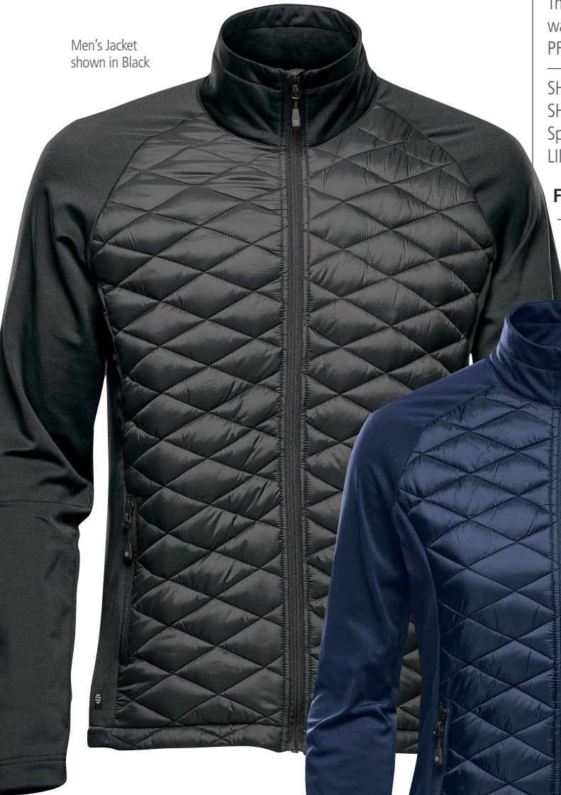
Men's Jacket shown in Black