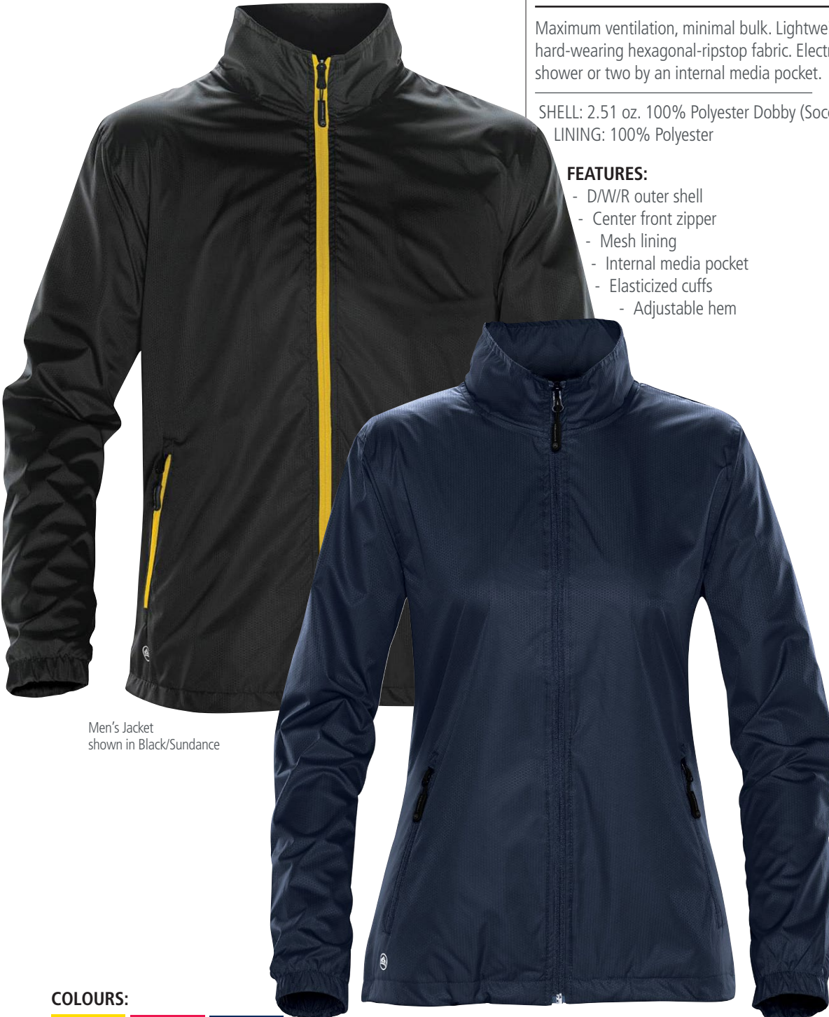
Men's Jacket shown in Black/Sundance