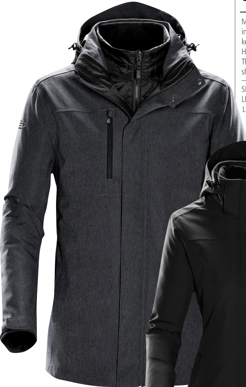
Men's Jacket shown in Charcoal Twill