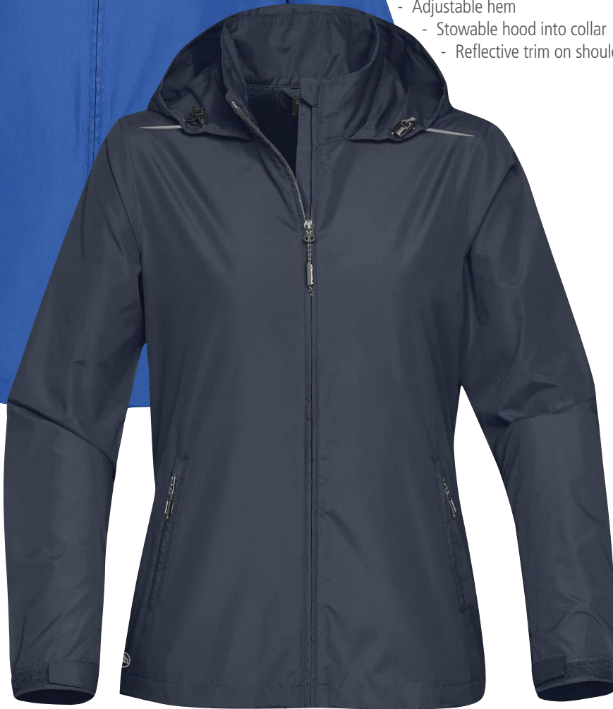
Women's Jacket shown in Navy