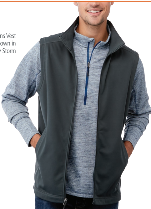
Mens Vest shown in Grey Storm