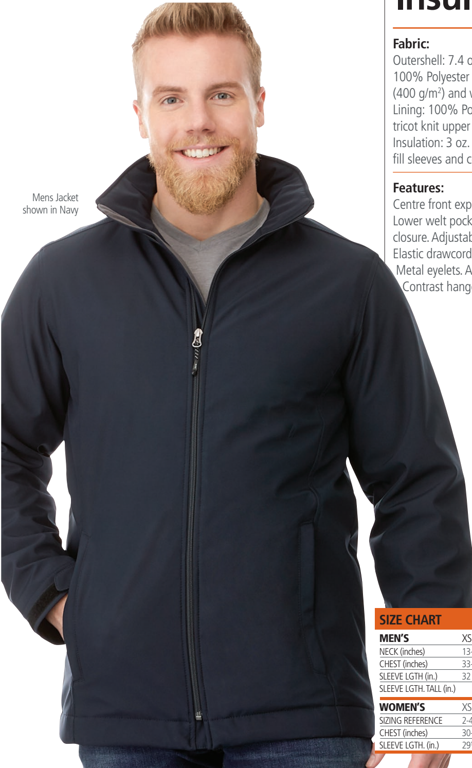
Mens Jacket shown in Navy