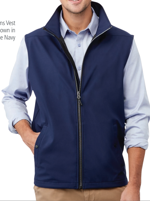
Mens Vest shown in Vintage Navy