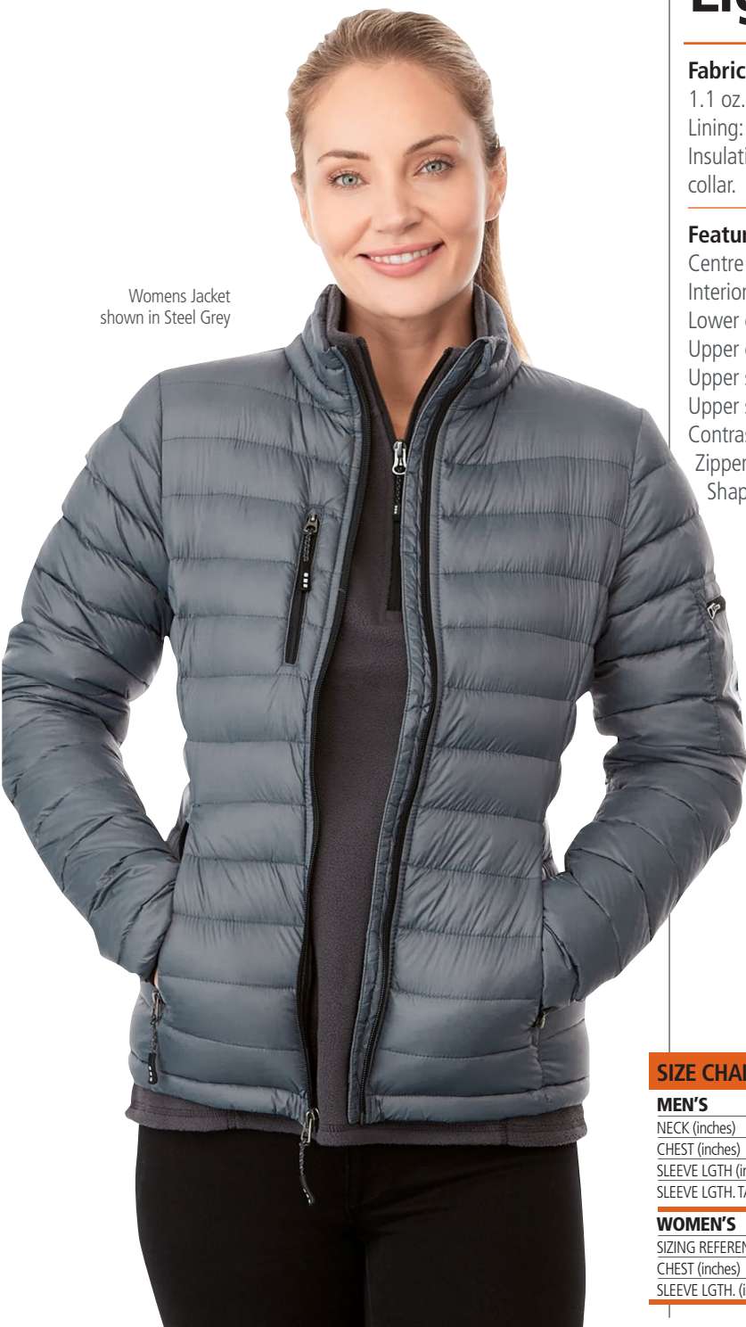
Womens Jacket shown in Steel Grey