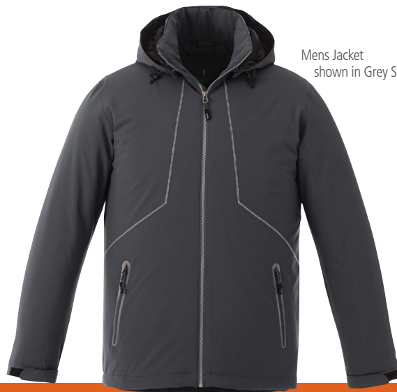
Mens Jacket shown in Grey Storm

Centre front exposed plastic zipper with contrast teeth. Interior zipper flap. Lower exposed reverse coil zipper pockets. Interior zipper pocket. Interior mesh stowable pocket. Detachable snap off contour hood with drawcord and interior cordlocks. Adjustable cuff tabs with hook and loop closure. Elastic drawcord at hem with interior cordlocks. Dropped back hem. Welded reflective graphic detail. Plastic eyelets. Articulated elbows. Contrast inner hood. Brushed pocket bags.