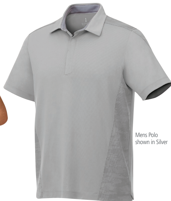
Mens Polo shown in Silver

Diminishing contrast piping. Heat transfer main label for tagless comfort. Heat transfer reflective graphic detail. Contrast under collar. Contrast inner sleeve hem. Contrast inner collar stand. Centre front three hidden button placket (mens). Centre front no-button placket (womens). Shaped seams and tapered waist (womens).