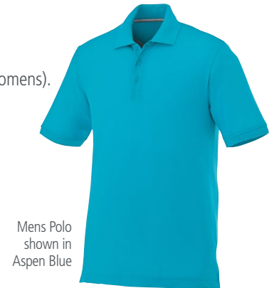
Mens Polo shown in Aspen Blue

Centre front three button placket. Flat knit collar and cuffs. V-notch side slits. Dyed-to-match buttons. Contrast inner neck tape. Shaped seams and tapered waist (womens).