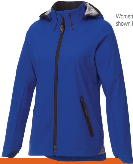
Womens Jacket shown in New Royal

Centre front exposed contrast reverse coil zipper. Interior laminated storm flap with chin guard. Lower welded contrast reverse coil zipper pockets. Interior pocket with hook and loop closure. Interior media pocket. Detachable snap off hood with contrast binding on hood opening. Laminated contoured cuffs with contrast binding. Elastic drawcord at hem with interior cordlocks. Dropped back hem. Lower pocket hem cinch access. Easy grip zipper pulls. Interior media exit port with cord guide. Plastic eye-lets. Plastic key hook. Critical seam sealed. Articulated elbows. Ergonomic sleeves. Contrast brushed inner collar detail. Back vent. Interior system snap tabs for liner add in. Zipper garage pocket feature. Hanger loop at inside back neck. Laminated peak.