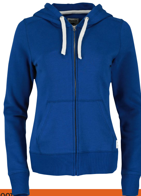
Womens Hoody shown in Cobalt

Shaped seams and tapered waist (womens).