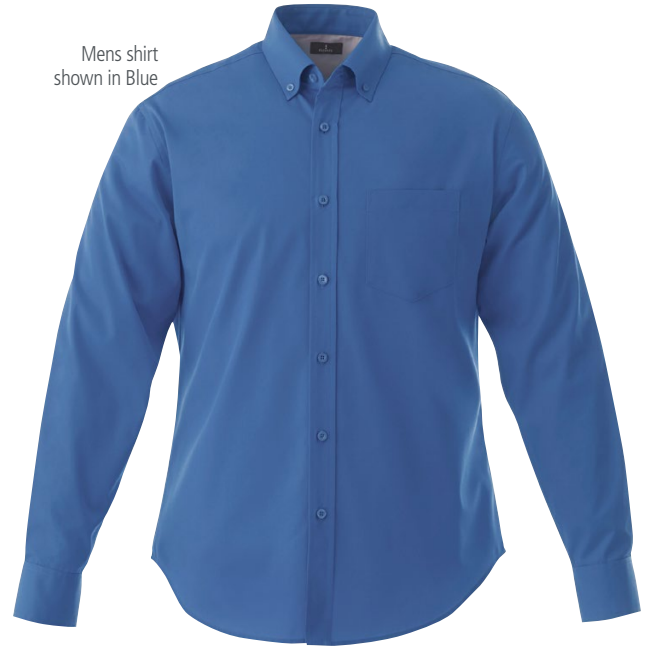
Mens shirt shown in Blue

Shaped seams and tapered waist (womens).