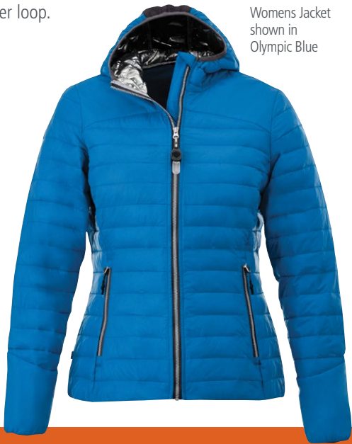
Womens Jacket shown in Olympic Blue