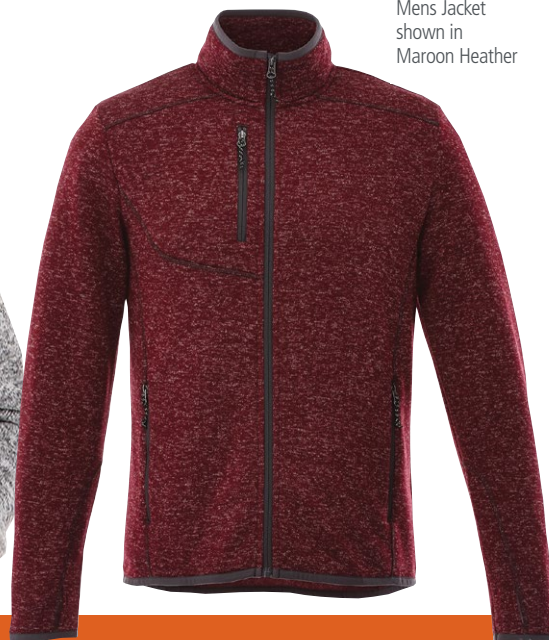
Mens Jacket shown in Maroon Heather

Centre front exposed contrast reverse coil zipper, contrast interior zipper flap. Lower exposed contrast reverse coil zipper pockets, upper exposed contrast reverse coil zipper pocket, contrast binding on collar. Sleeve cuffs with thumb exit, contrast binding on cuffs. Dropped back hem, contrast binding on hem. Contrast coverstitching, easy grip zipper pulls. Heat transfer main label for tagless, comfort. Interior media exit port with cord guide. Contrast inner yoke, contrast inner neck tape. Contrast hanger loop at inside back neck.