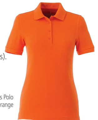
Womens Polo shown in Orange

Centre front three button placket. Flat knit collar and cuffs. V-notch side slits. Twin needle topstitching. Dyed-to-match buttons. Hanger loop at inside back neck. Shaped seams and tapered waist (womens).