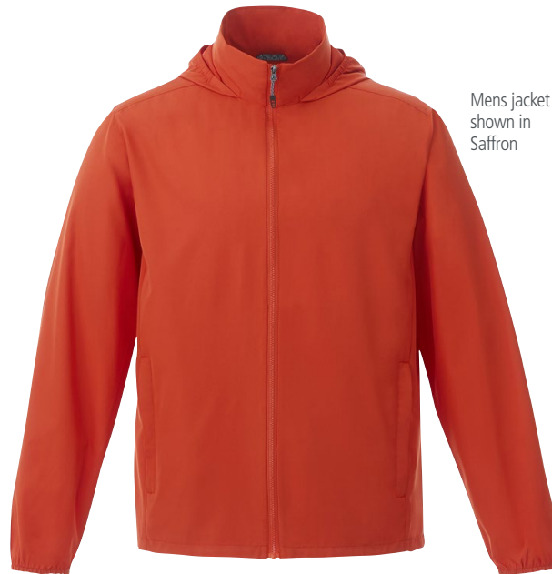
Mens jacket shown in Saffron

Centre front exposed plastic zipper. Lower concealed coil zipper pockets. Roll-away hood with elasticized opening. Elasticized cuffs. Heat transfer main label for tagless comfort. Articulated elbows. Ergonomic sleeves. Shaped seams and tapered waist (womens) Contrast hanger loop at inside back neck. Packable.