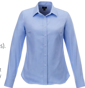
Womens Shirt shown in Sky

Centre front button placket. Self fabric collar with stand. Adjustable one button cuffs with single pleats. Shirttail hem. Contrast horn buttons. Flat-felled seams. Centre back box pleat (mens). Button-down shirt collar (mens). Back darts / bust darts (womens). Shaped seams and tapered waist (womens).