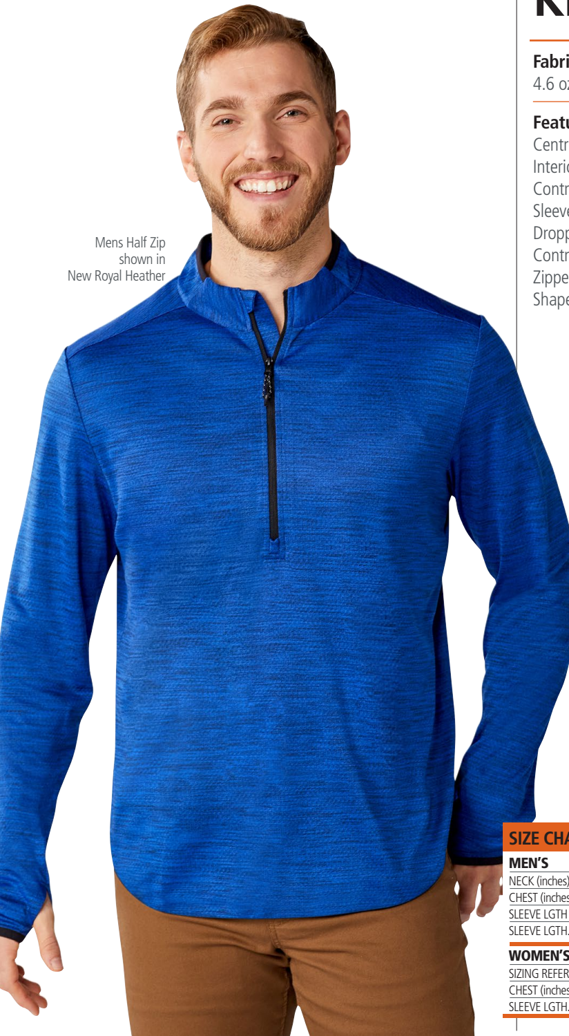
Mens Half Zip shown in New Royal Heather