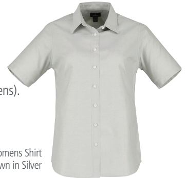
Womens Shirt shown in Silver

Centre front button placket. Self fabric collar with stand. Shirttail hem. Contrast horn buttons. Flat-felled seams. Back yoke. Centre back box pleat (mens). Button-down shirt collar (mens). Back darts / bust darts (womens). Shaped seams and tapered waist (womens).