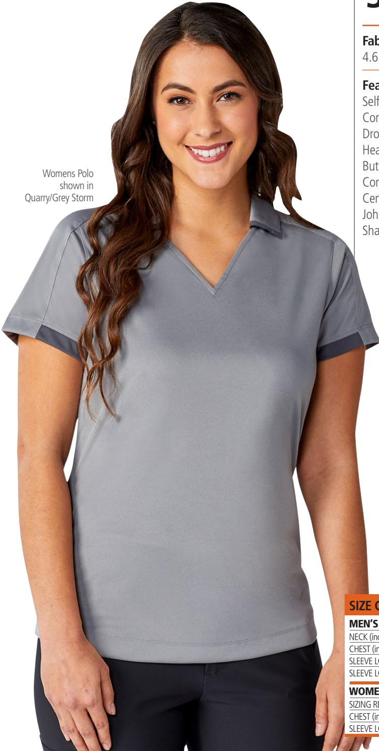
Womens Polo shown in Quarry/Grey Storm