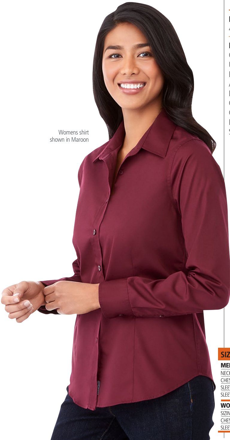
Womens shirt shown in Maroon