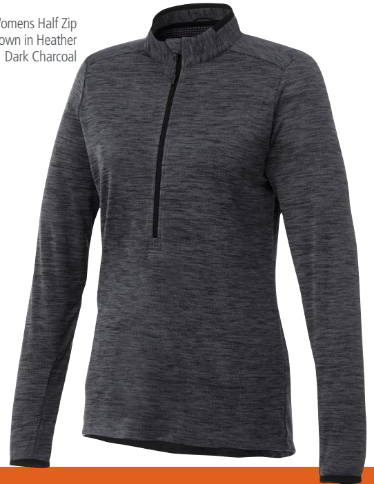
Womens Half Zip shown in Heather Dark Charcoal

Shaped seams and tapered waist (womens).