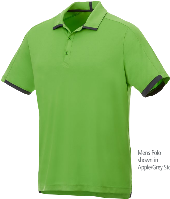
Mens Polo shown in Apple/Grey Storm