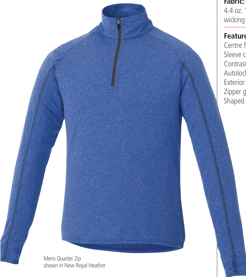
Mens Quarter Zip shown in New Royal Heather