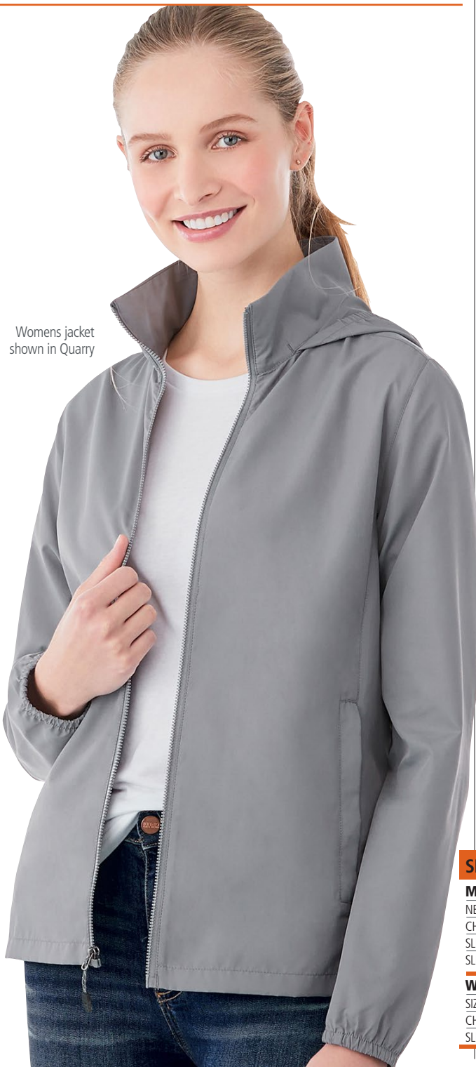
Womens jacket shown in Quarry