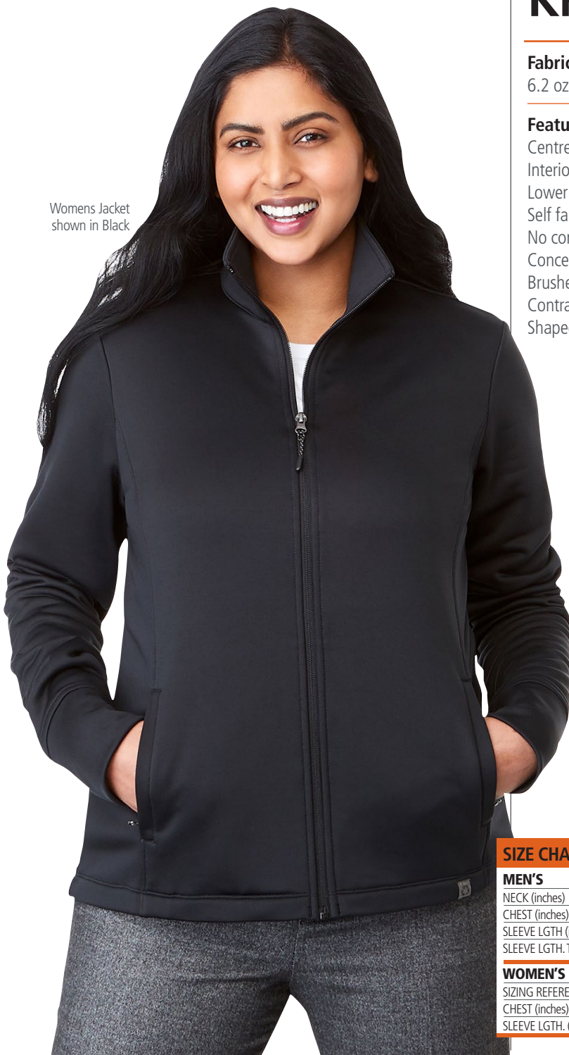
Womens Jacket shown in Black