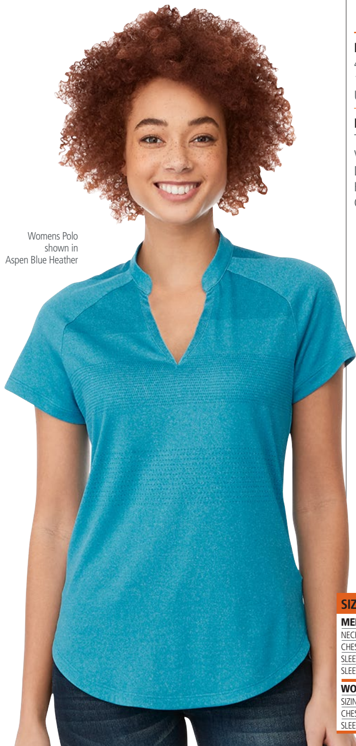
Womens Polo shown in Aspen Blue Heather