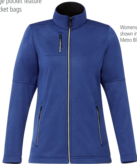
Womens Jacket shown in Metro Blue Heather