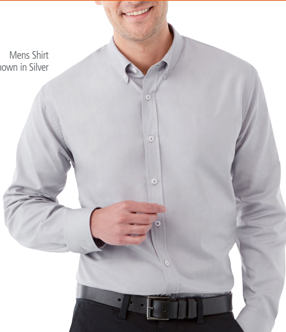
Mens Shirt shown in Silver