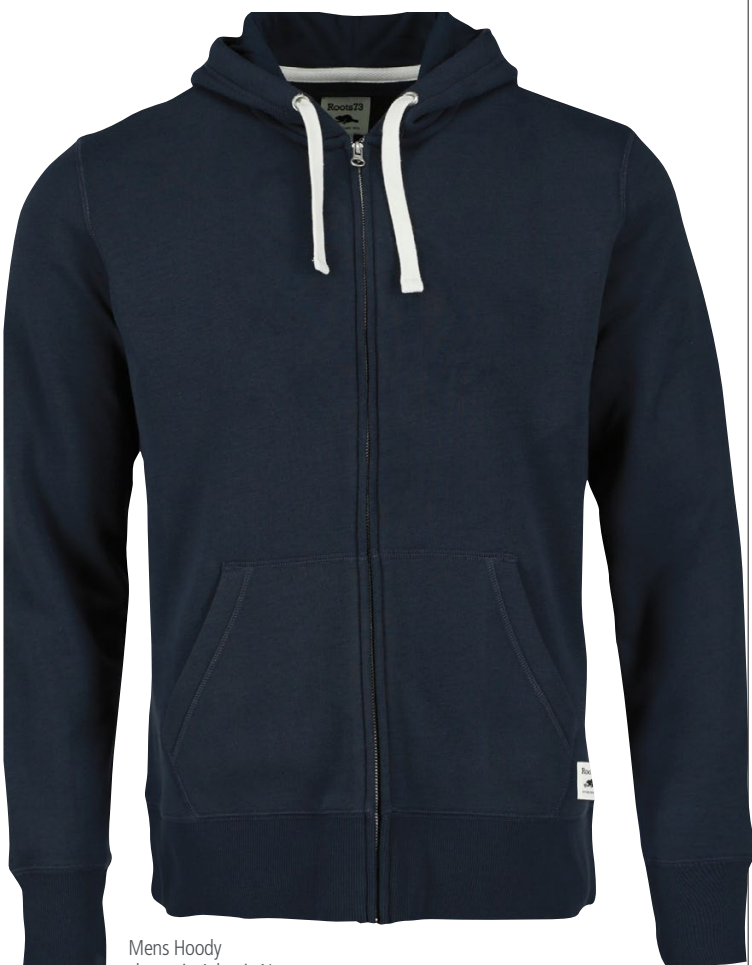
Mens Hoody shown in Atlantic Navy