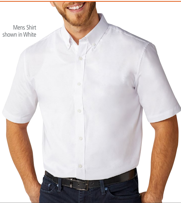
Mens Shirt shown in White