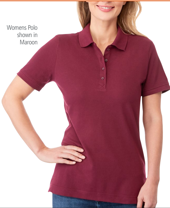
Womens Polo shown in Maroon