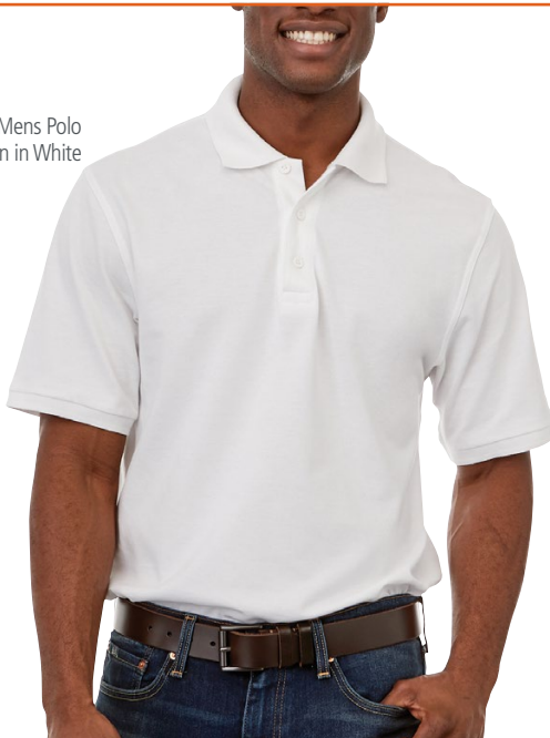
Mens Polo shown in White