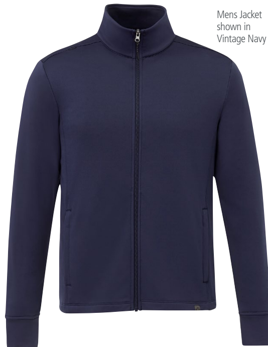
Mens Jacket shown in Vintage Navy