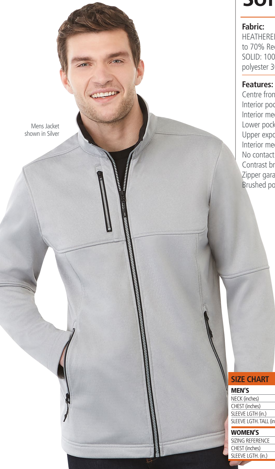
Mens Jacket shown in Silver