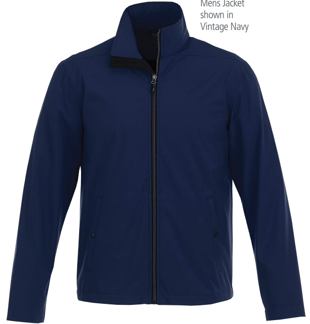
Mens Jacket shown in Vintage Navy

Centre front exposed reverse coil zipper, interior zipper flap. Lower welt pockets with snap closure. Easy grip zipper pulls. Articulated elbows, ergonomic sleeves. Contrast hanger loop at inside back neck. Interior back yoke for custom branding.