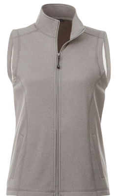
Womens Vest shown in Heather Grey

Shaped seams and tapered waist (womens).