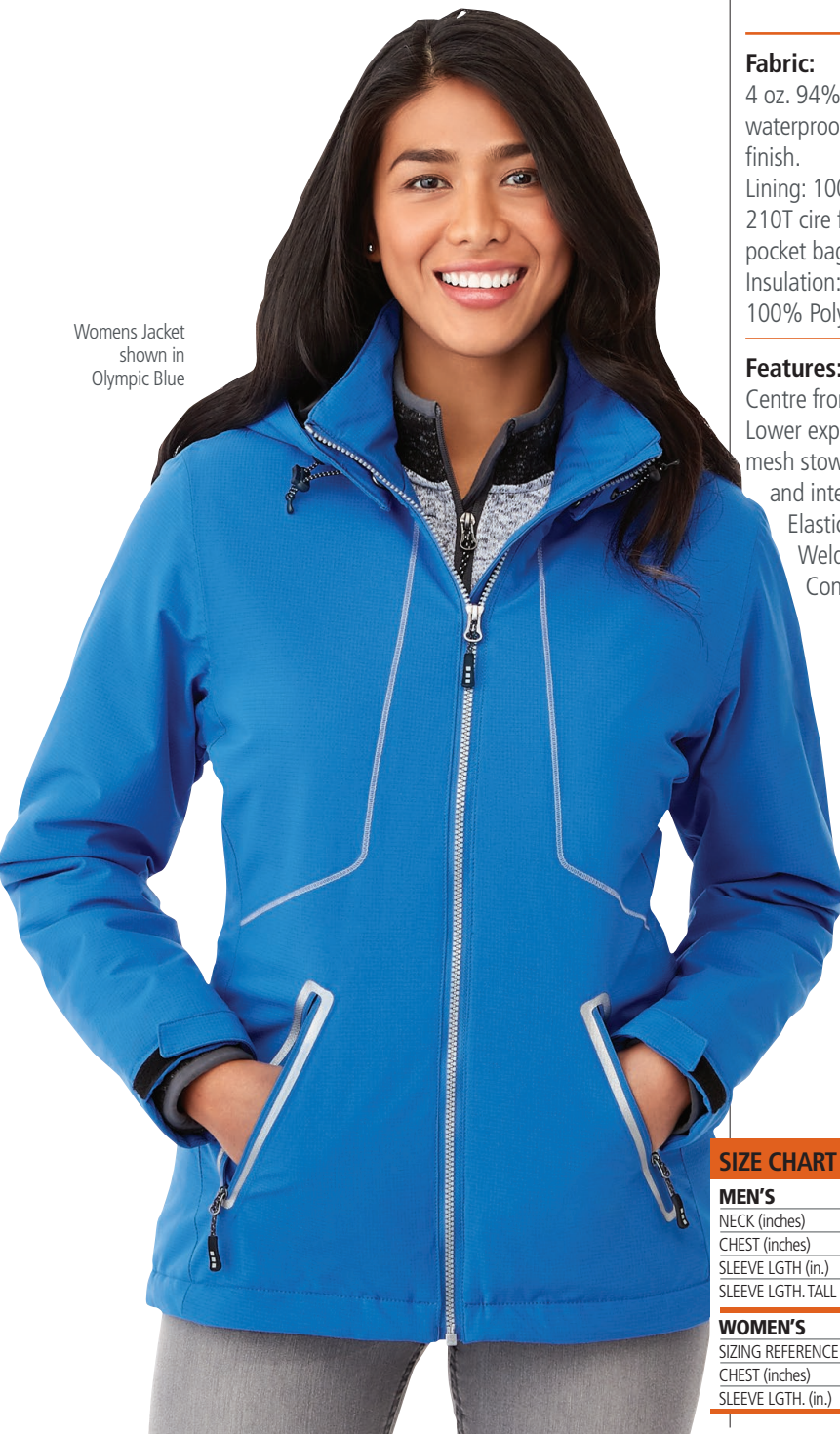
Womens Jacket shown in Olympic Blue