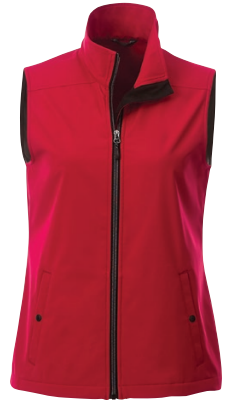
Womens Vest shown in Team Red

Shaped seams and tapered waist (womens).