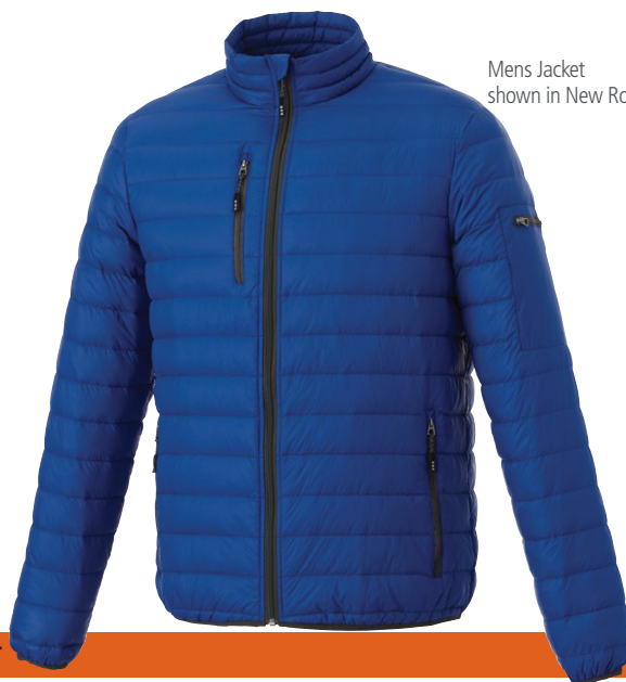
Mens Jacket shown in New Royal

Centre front exposed contrast coil zipper. Interior storm flap with chin guard. Lower exposed contrast coil zipper pockets. Upper exposed contrast coil zipper pocket. Upper sleeve exposed contrast coil zipper pocket. Upper sleeve patch pocket. Contrast binding on cuffs and hem. Zipper garage pocket feature. Shaped seams and tapered waist (womens).