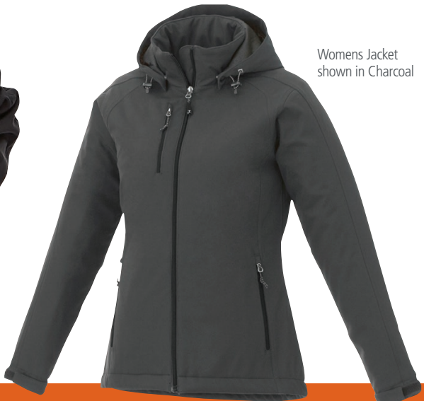
Womens Jacket shown in Charcoal

Dropped back hem. Narrow twin needle topstitch detail. Metal eyelets. Articulated elbows. Contrast inner hood. Zipper garage pocket feature. Contrast hanger loop at inside back neck.