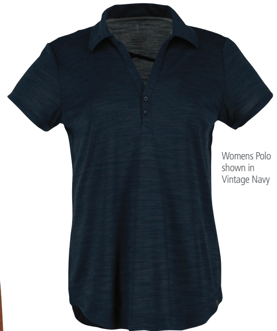
Womens Polo shown in Vintage Navy

Shaped seams and tapered waist (womens).