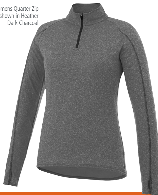
Womens Quarter Zip shown in Heather Dark Charcoal

Shaped seams and tapered waist (womens).