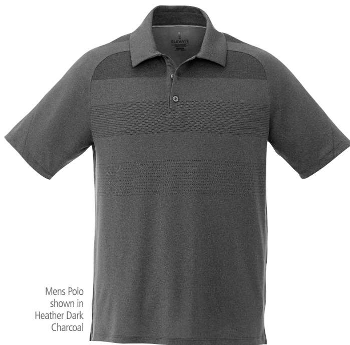
Mens Polo shown in Heather Dark Charcoal

Two piece self fabric collar. V-notch side slits, side seam taping detail. Dyed-to-match buttons. Heat transfer main label for tagless comfort Contrast graphic print detail and contrast inner neck tape.