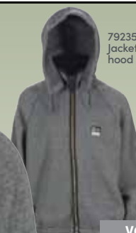
79235 Jacket with detachable hood